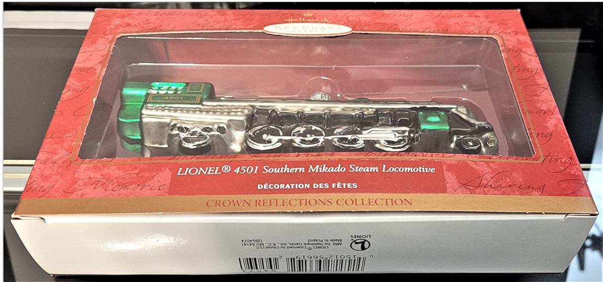
Figure 2: Ornament in its original packaging, front view.