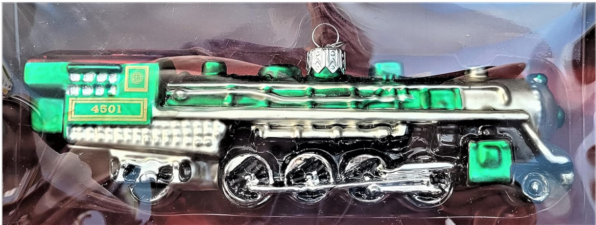
Figure 1: Front view of the Lionel 4501 Southern Mikado Steam Locomotive Keepsake Ornament.

Please read these instructions carefully to ensure the longevity and preservation of your ornament.