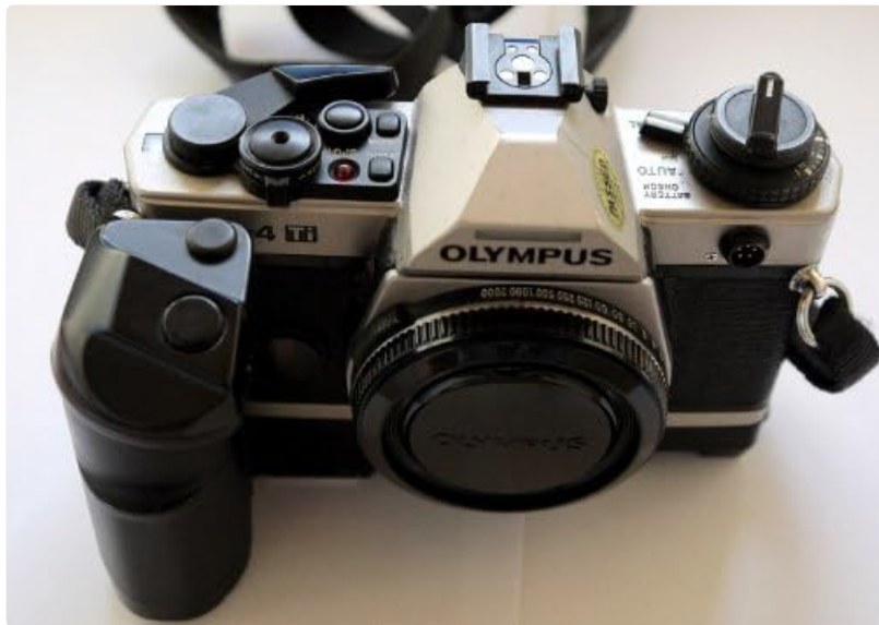
Figure 1: Front view of the Olympus OM-4 35mm Film SLR Camera, showing the lens, body, and attached grip.

Welcome to the user manual for your Olympus OM-4 35mm Film SLR Camera. This manual provides essential information for setting up, operating, and maintaining your camera to ensure optimal performance and longevity. The Olympus OM-4 is a classic 35mm SLR camera known for its advanced metering system and robust build quality, offering photographers precise control over their images.