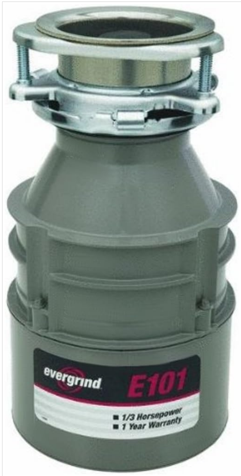
Image: The Emerson Evergrind E101 Garbage Disposer, showing its compact grey body, metal sink flange, and included power cord. This unit is designed for under-sink installation.