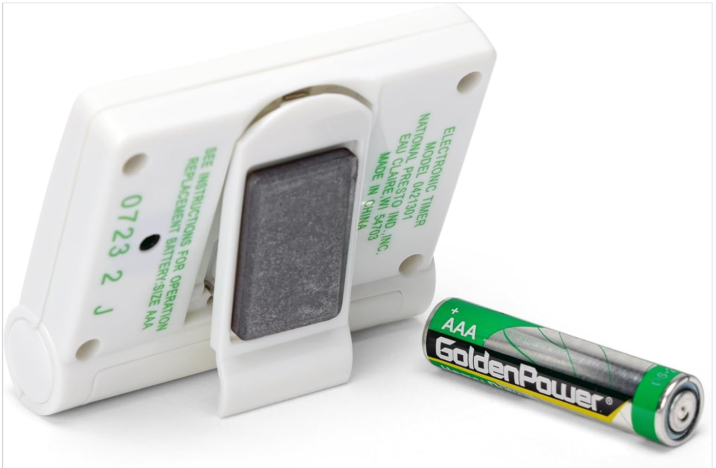
Image: Back view of the timer with the easel stand deployed, revealing the battery compartment and a separate AAA battery.