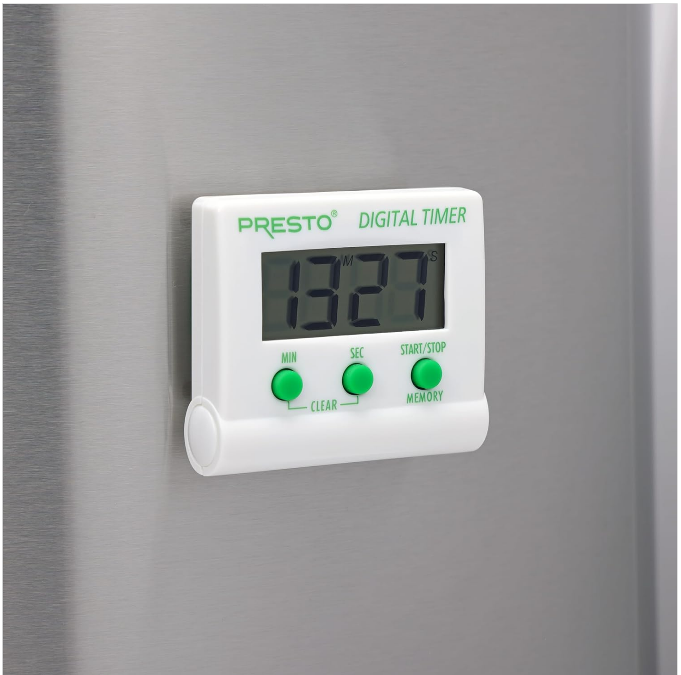
Image: Front view of the Presto Digital Timer, displaying the time and showing the MIN, SEC, and START/STOP/MEMORY buttons.