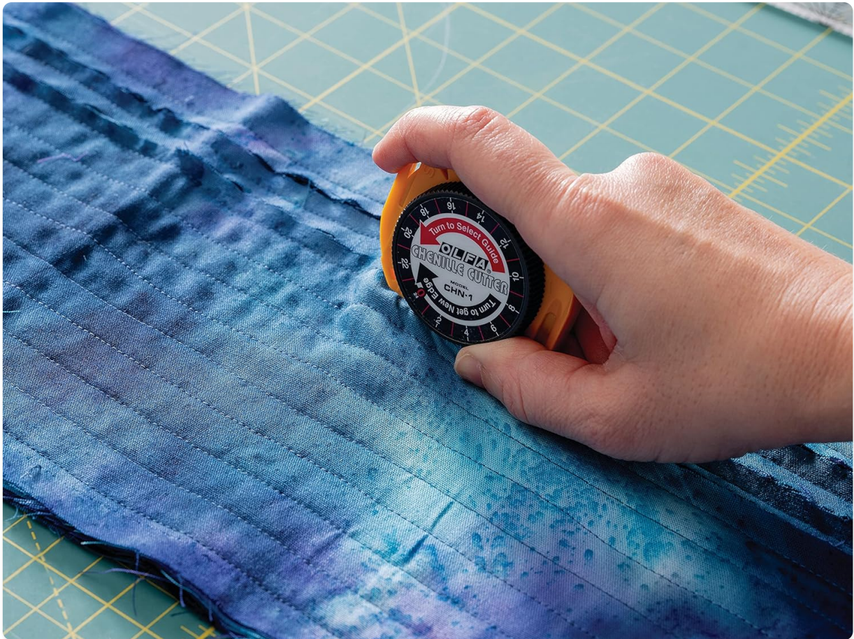
Image: The OLFA Chenille Cutter in action, demonstrating how to guide the tool along sewn channels to create chenille.