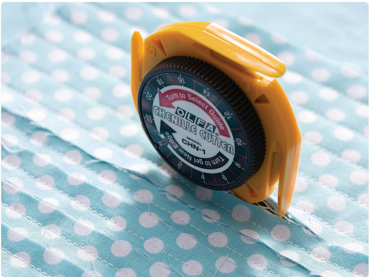
Image: Fabric with multiple parallel channels sewn, demonstrating the preparation for chenille cutting.