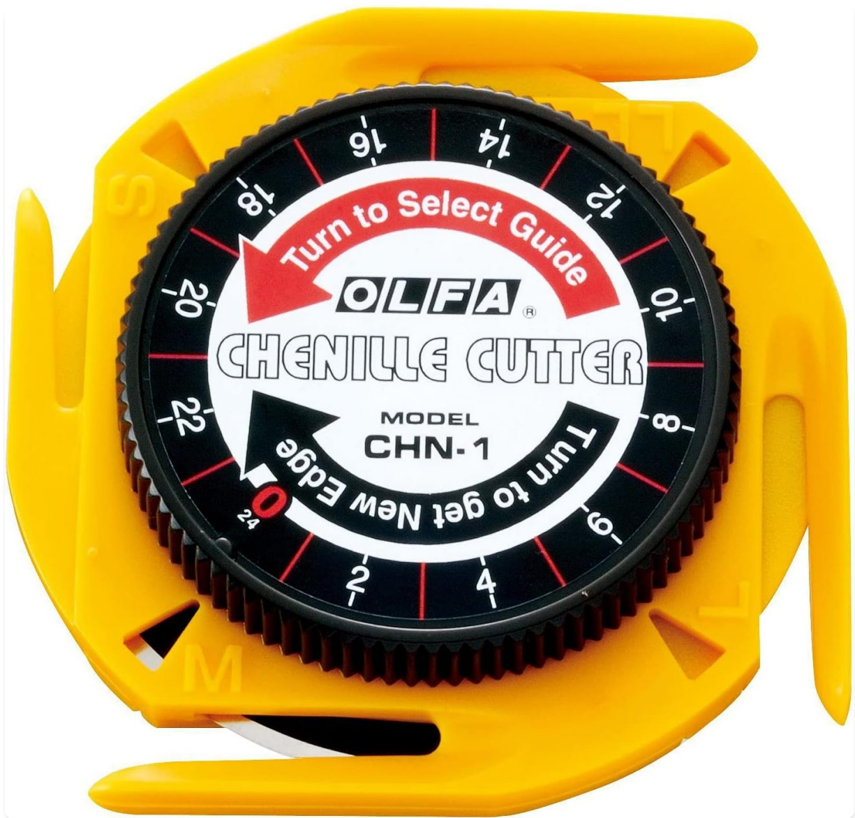
Image: Front view of the OLFA Chenille Cutter, highlighting the dial for selecting channel guides and blade exposure.