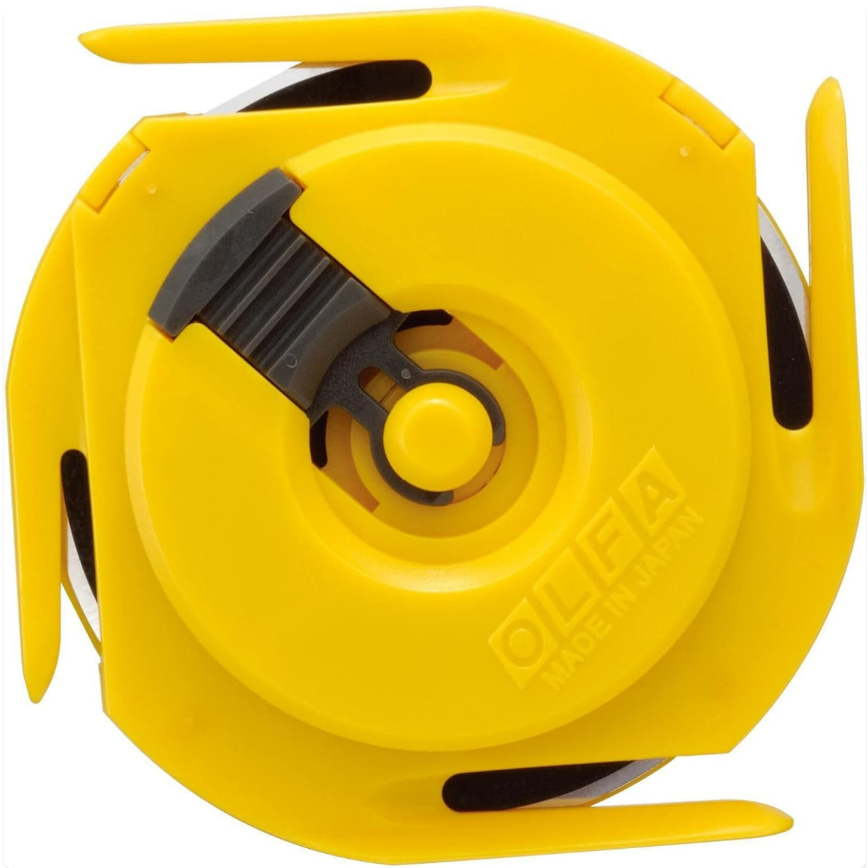
Image: Back view of the OLFA Chenille Cutter, illustrating the blade replacement mechanism.