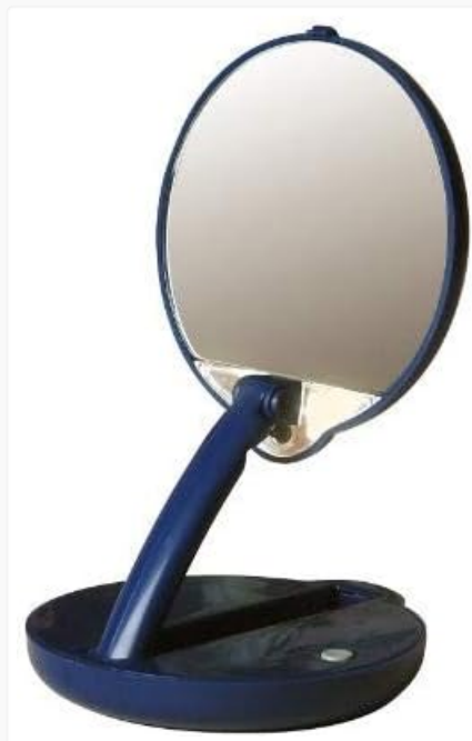
Figure 2: Mirror in upright position for vanity use.

The mirror's adjustable arm allows it to be set up for hands-free use on a surface.