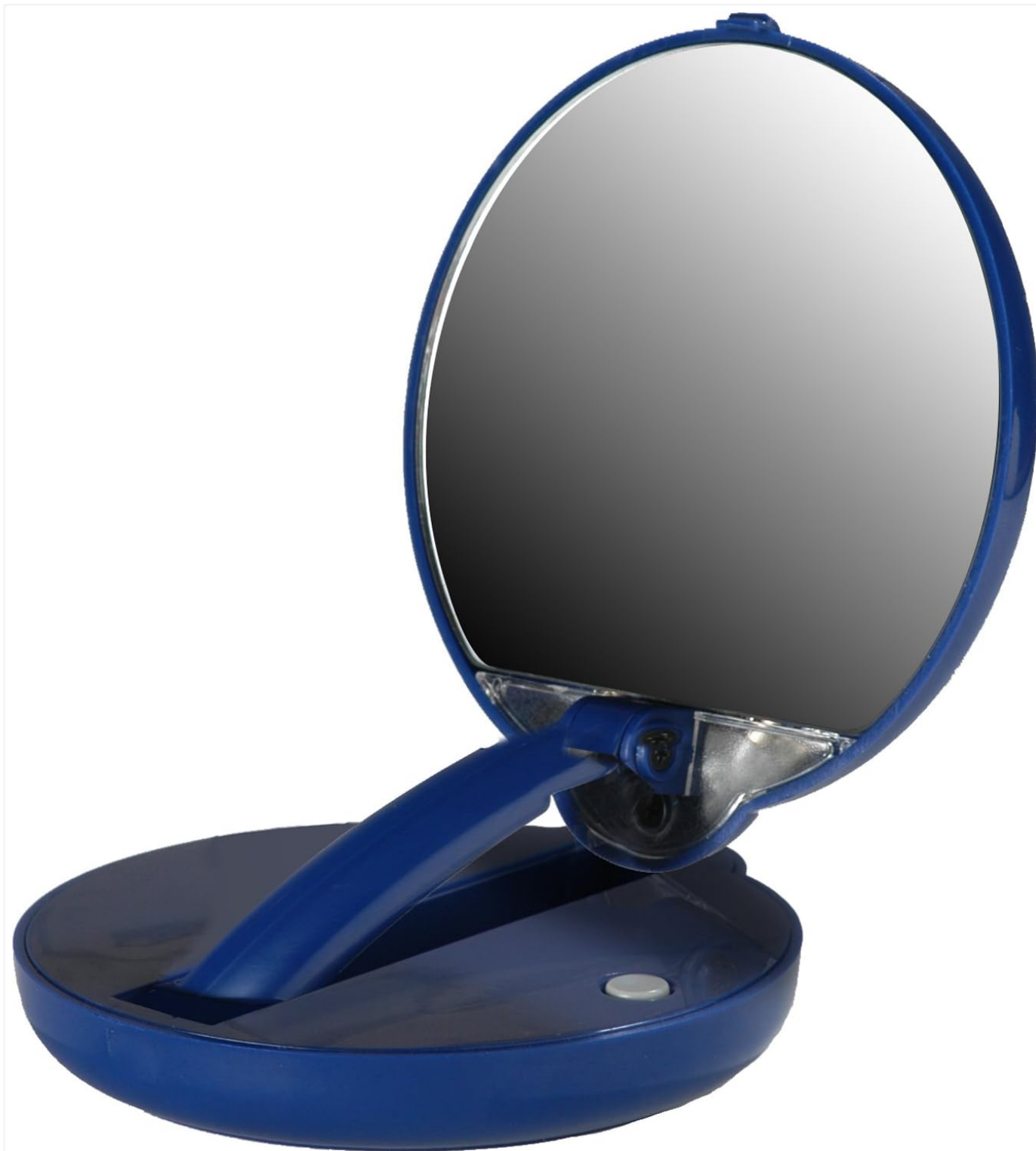
Figure 1: Floxite FL-15ACP 15X Magnification Mirror (folded)

The Floxite FL-15ACP mirror is shown here in its compact, folded state, ideal for storage or travel.