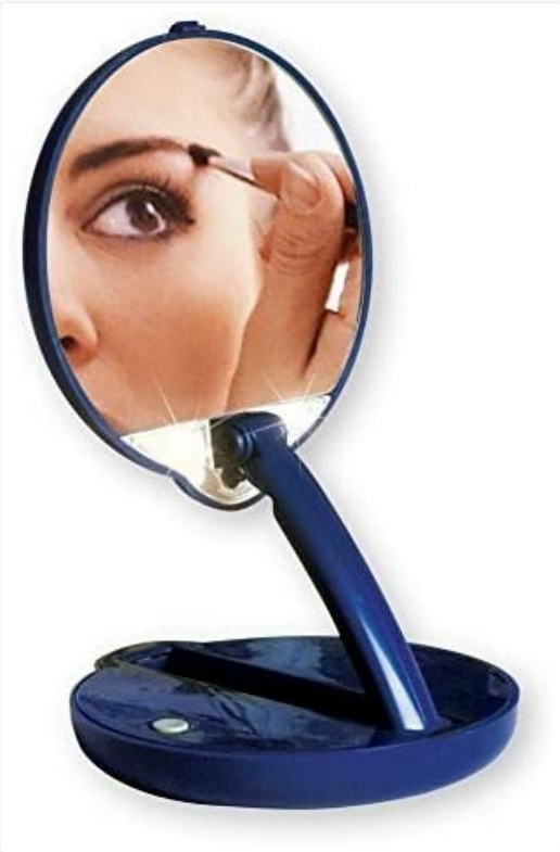
Figure 3: Applying makeup with the 15X magnification mirror. The high magnification is beneficial for precise application of cosmetics.