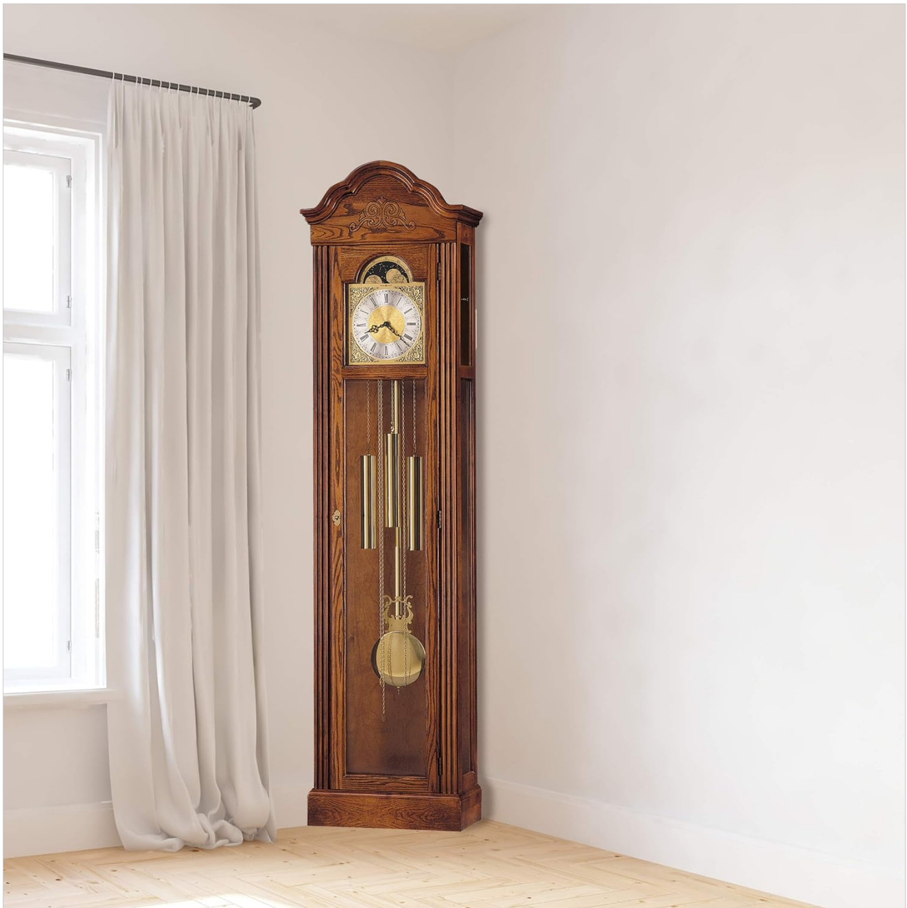
Figure 1: The Howard Miller Ashley Floor Clock, Model 610519, showcasing its full design in a home environment.