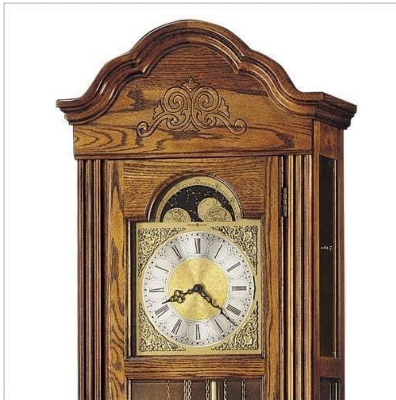
Figure 3: The detailed clock face with Roman numerals and the decorative moon phase dial.