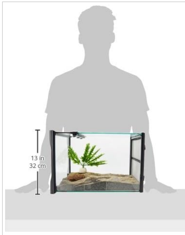
Figure 3: Terrarium dimensions.