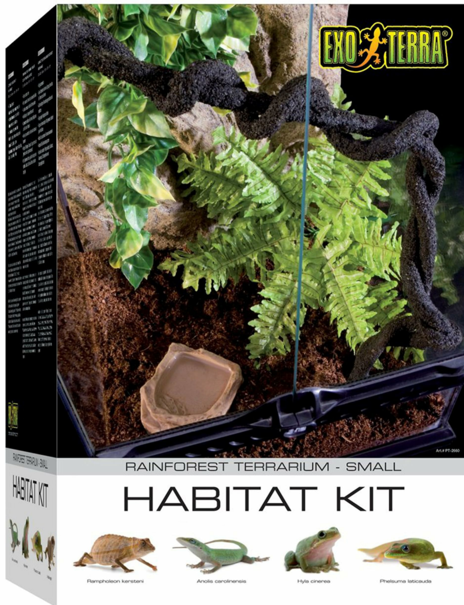
Figure 1: Fully assembled Exo Terra Rainforest Habitat Kit.