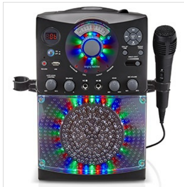
Image: Front view of the SML385BTBK unit, highlighting the control panel with buttons and knobs.