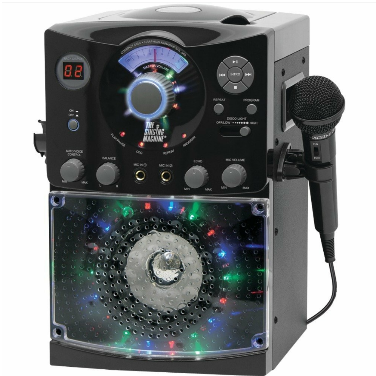
Image: The Singing Machine SML385BTBK Karaoke System, black, featuring a top-loading CD player and front-facing LED disco lights.