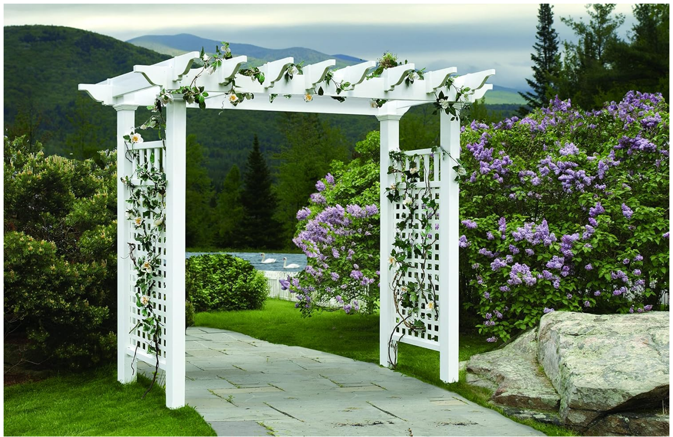
Image: The arbor integrated into a garden setting, supporting climbing plants.

The integrated lattice panels and overhead rafters are designed to support various climbing plants such as roses, clematis, ivy, or grapevines. Gently guide young plant tendrils through the lattice openings to encourage upward growth and coverage.