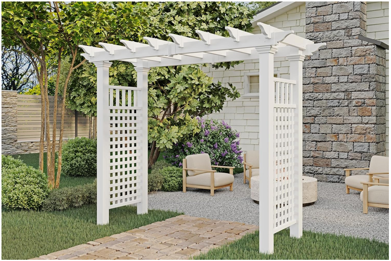
Image: The Vita Fairfield Grande Vinyl Arbor installed in a garden setting.