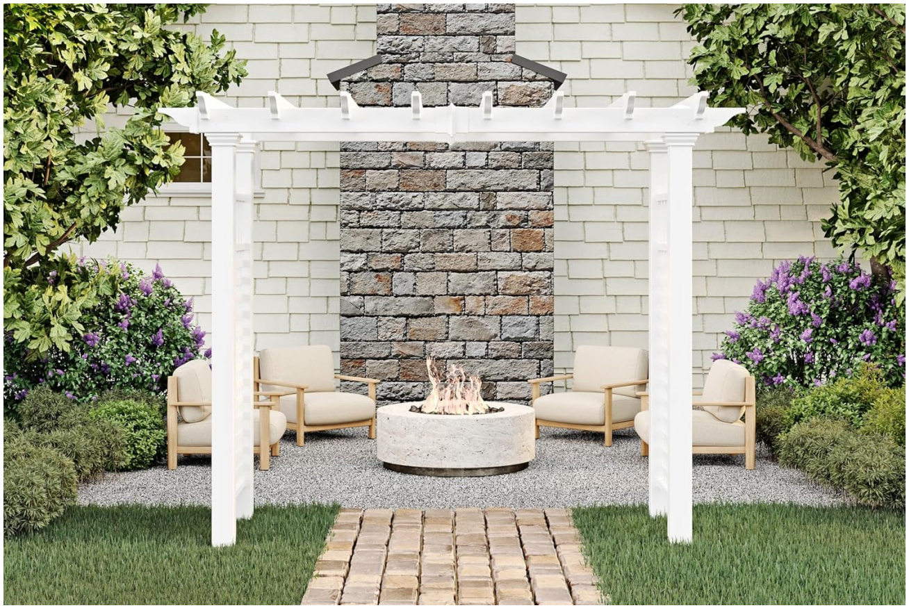
Image: A well-maintained Vita Fairfield Grande Vinyl Arbor, showcasing its clean appearance.