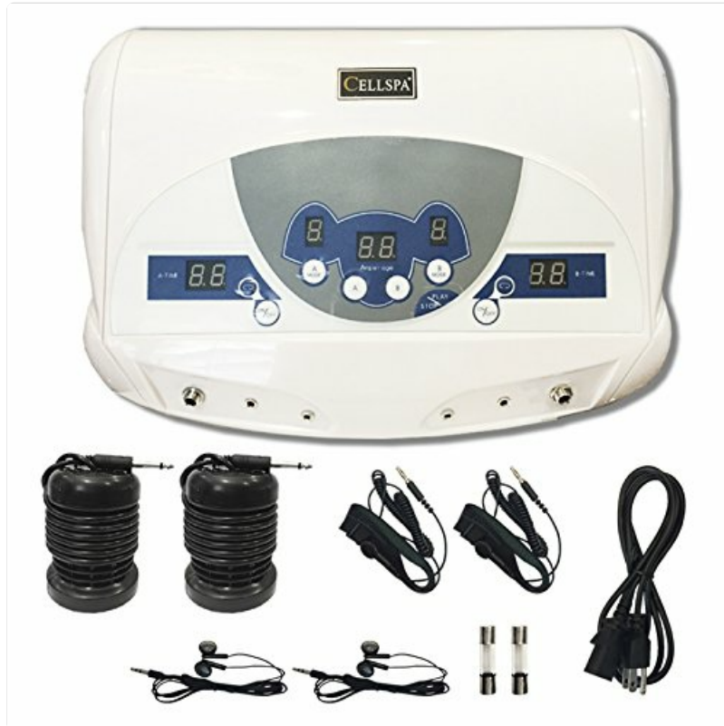
Image: The Cell Spa Dual Ionic Ion Detox Aqua Foot Spa Machine shown with its included accessories: two arrays, two wrist straps, a power cord, and two earphone plugs.

Note: A foot tub or basin is not included with this unit and must be provided separately.