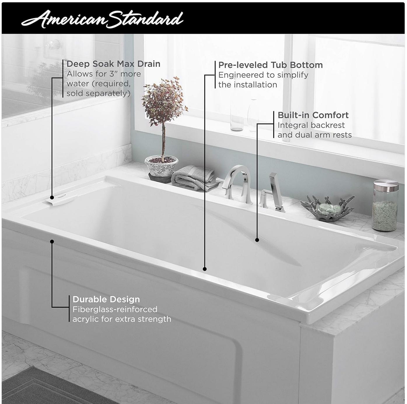
Figure 2: Detailed diagram illustrating the key features of the tub, such as the Deep Soak Max Drain compatibility, pre-leveled tub bottom, built-in comfort elements, and durable fiberglass-reinforced acrylic design.