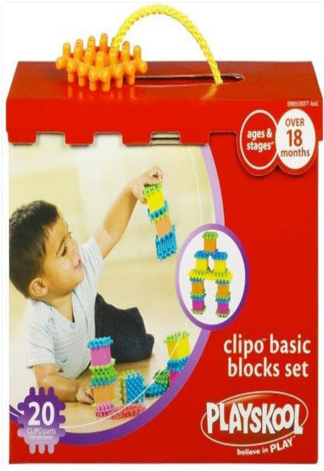
Image 1: The Playskool Clipo Basic Blocks Set packaging, featuring a child engaging with the colorful blocks. The box indicates "Over 18 months" and "20 Clipo parts".