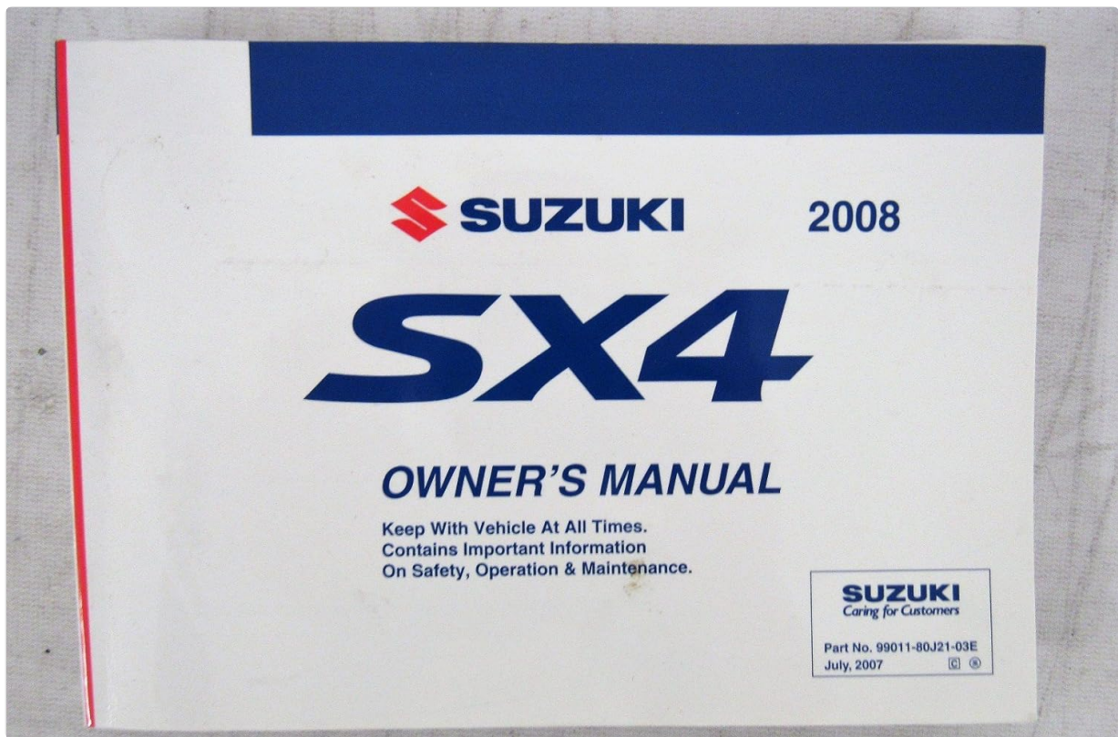
Image: The front cover of the primary 2008 Suzuki SX4 Owner's Manual, featuring the Suzuki logo, vehicle model name, and the title 'OWNER'S MANUAL', with a note to keep it with the vehicle.