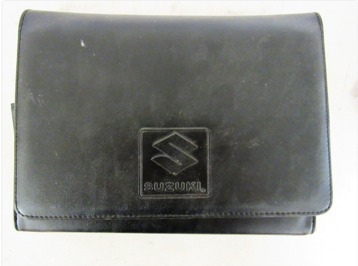
Image: A black, textured pouch with the Suzuki logo embossed, designed to hold the various owner's manuals and documents securely within the vehicle.

The 2008 Suzuki SX4 owner's manual set typically includes several booklets and documents, each serving a specific purpose to provide comprehensive information about your vehicle. These components are designed to be stored together, often within a dedicated pouch, for easy access.