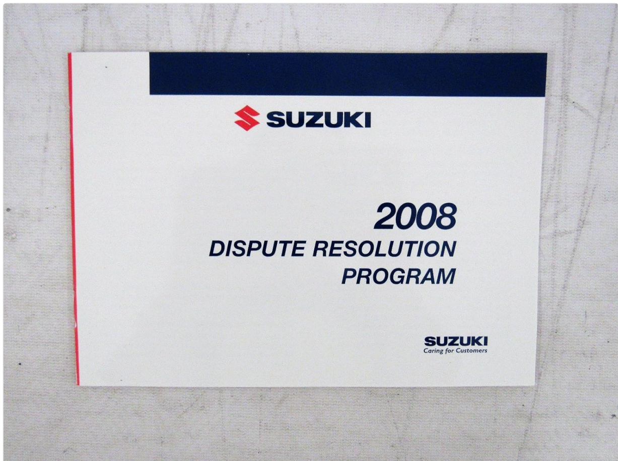
Image: The cover of the '2008 DISPUTE RESOLUTION PROGRAM' booklet, outlining the process for resolving disputes related to the vehicle or its warranty.