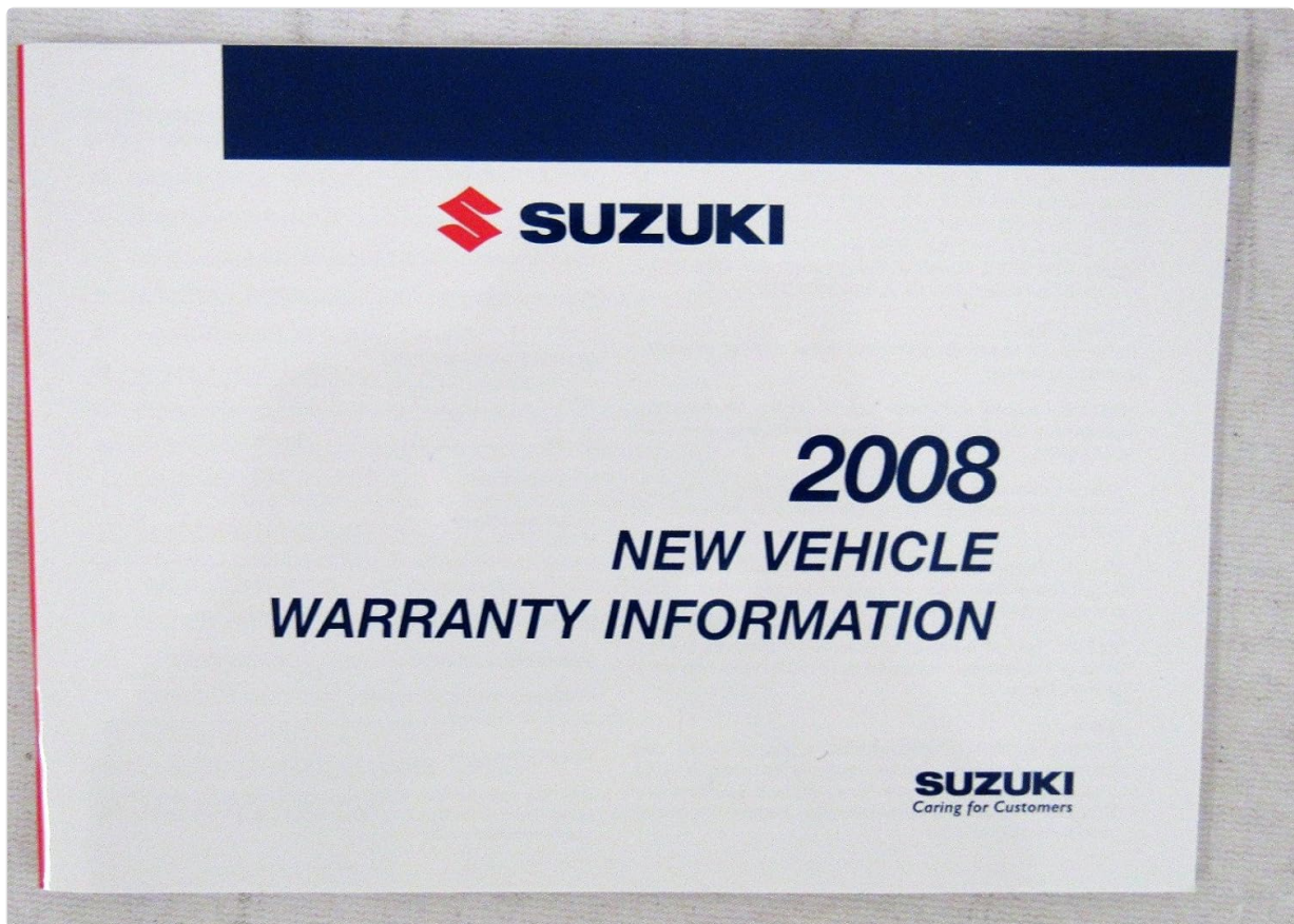
Image: The cover of the '2008 NEW VEHICLE WARRANTY INFORMATION' booklet, detailing the warranty terms and conditions for the Suzuki SX4.

This section provides crucial information regarding your vehicle's warranty coverage, dispute resolution procedures, and available roadside assistance programs. Understanding these details is important for protecting your investment and accessing support when needed.