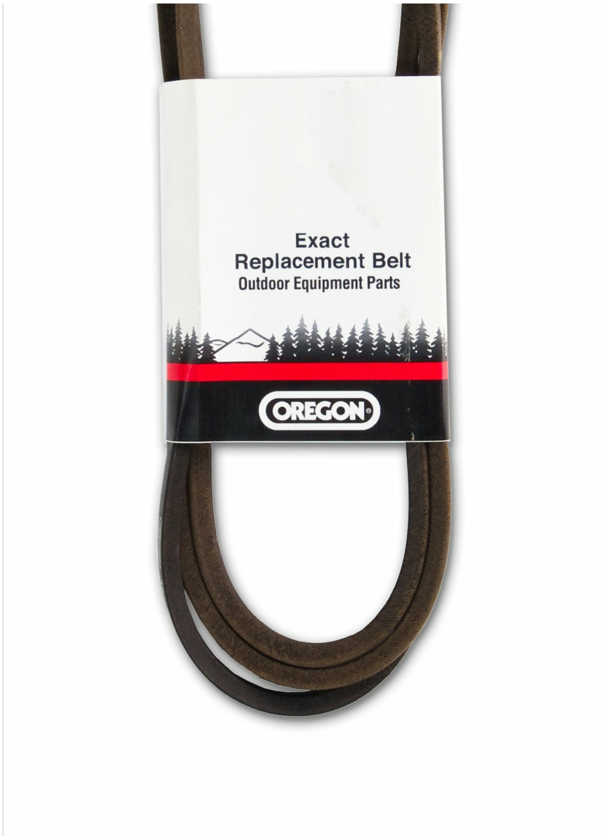
Image 1.1: The Oregon 75-820 Replacement Deck Belt. This belt is designed for durability and precise fit in compatible lawn mower models.