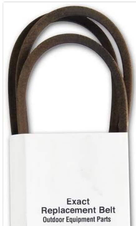
Image 3.2: Detail of the belt's wrapped clutching construction, designed for durability and efficient power transfer.