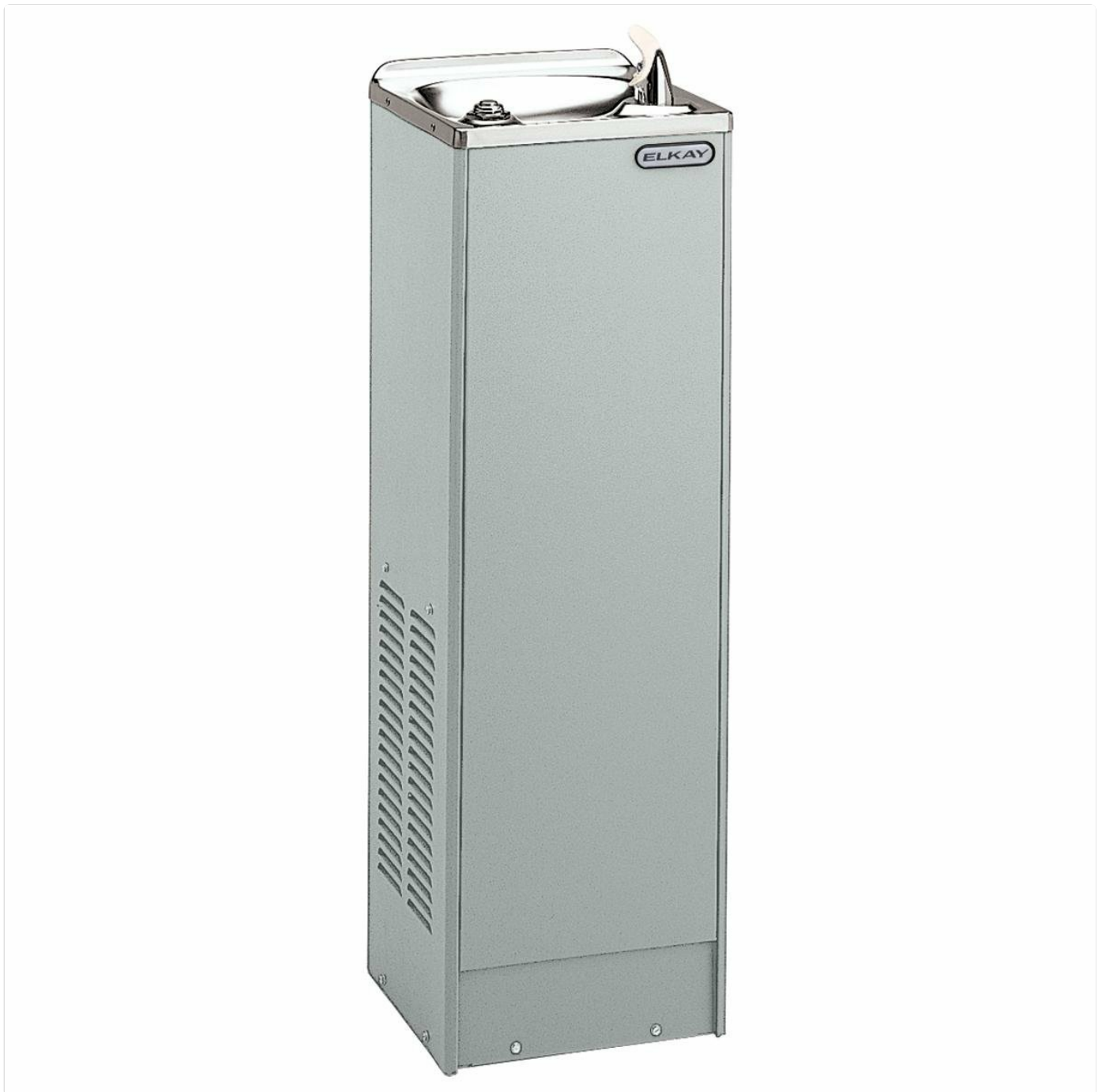
Figure 1: Front view of the Elkay FD7003L1Z Space-ette Cooler.