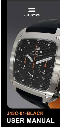
J43C-01-BLACK USER MANUAL

A comprehensive tutorial guide on utilizing the JUNG Switch Range Configurator within Autodesk Revit for efficient electrical planning. Covers BIM object creation, product configuration, symbol management, and troubleshooting.