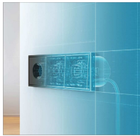
Electrical planning with the JUNG Switch Range Configurator in Autodesk Revit