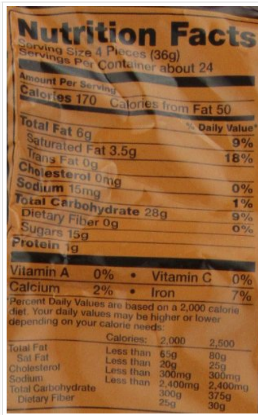
Figure 4.3: Detailed view of RIESEN candy nutrition facts.