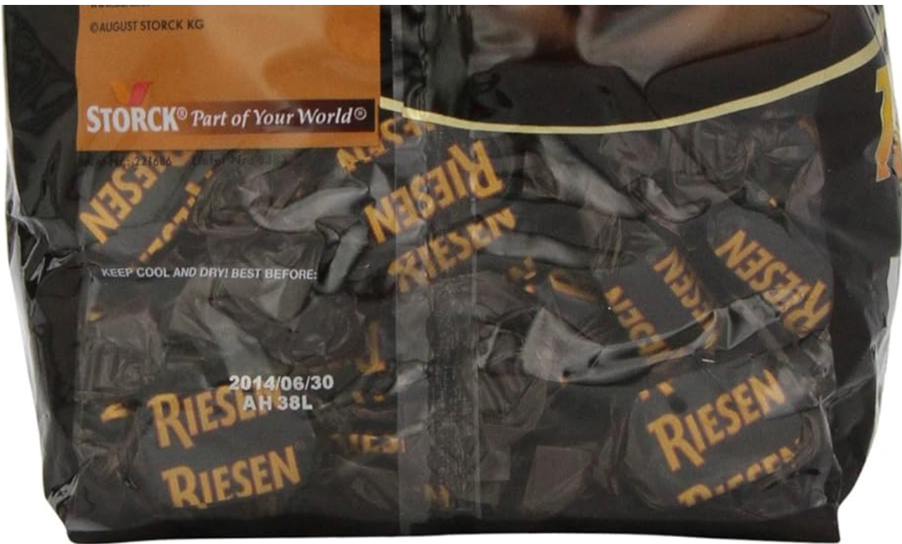
Figure 4.1: Back view of RIESEN Chewy Dark Chocolate Caramel Candy bag with nutritional information.