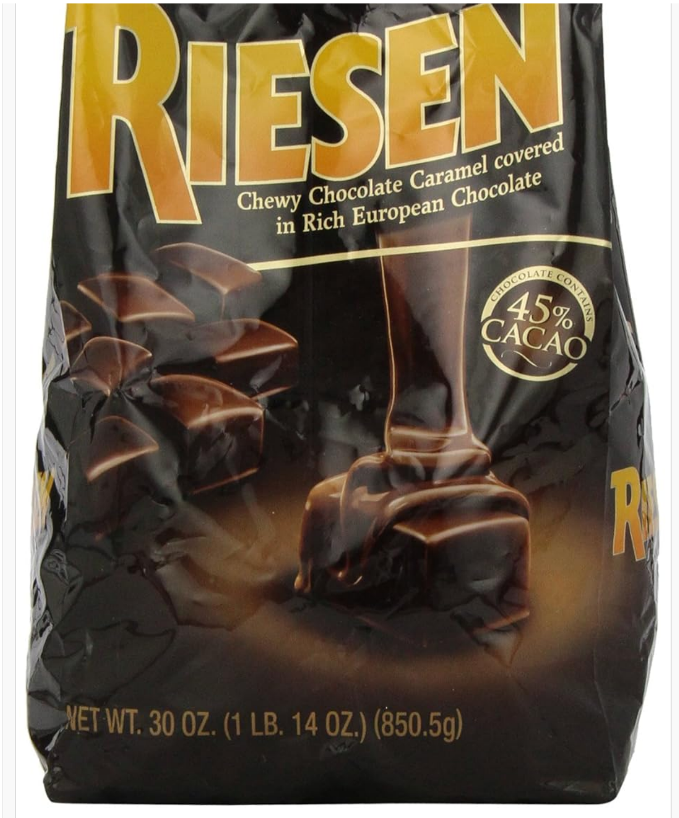
Figure 2.1: Front view of RIESEN Chewy Dark Chocolate Caramel Candy bag.