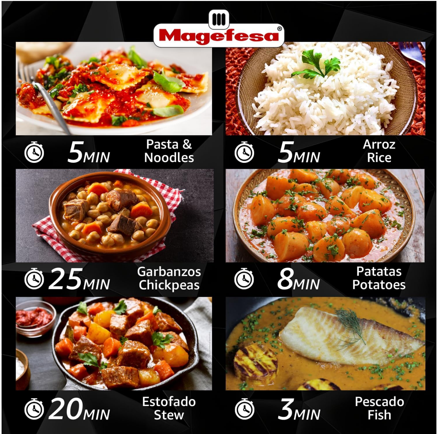
Image: A visual guide showing approximate cooking times for various dishes using the Magefesa Practika Plus pressure cooker.

Note: Cooking times are approximate and may vary based on food quantity, size, and desired doneness. Always consult a reliable pressure cooker recipe.