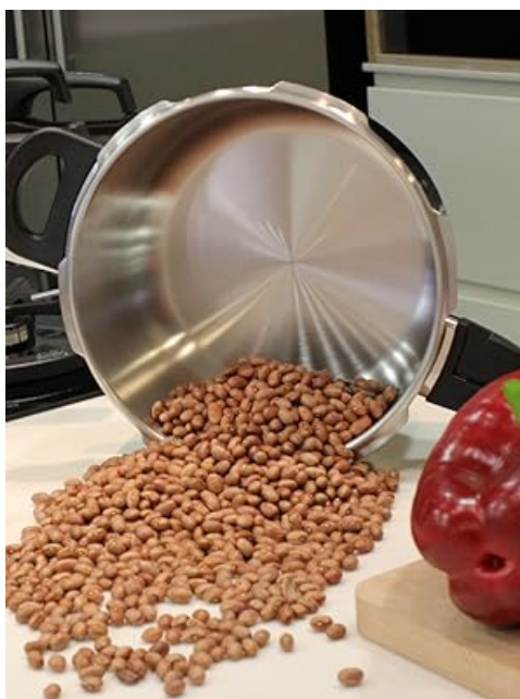
Image: The Magefesa Practika Plus pressure cooker with its lid securely closed, ready for cooking.