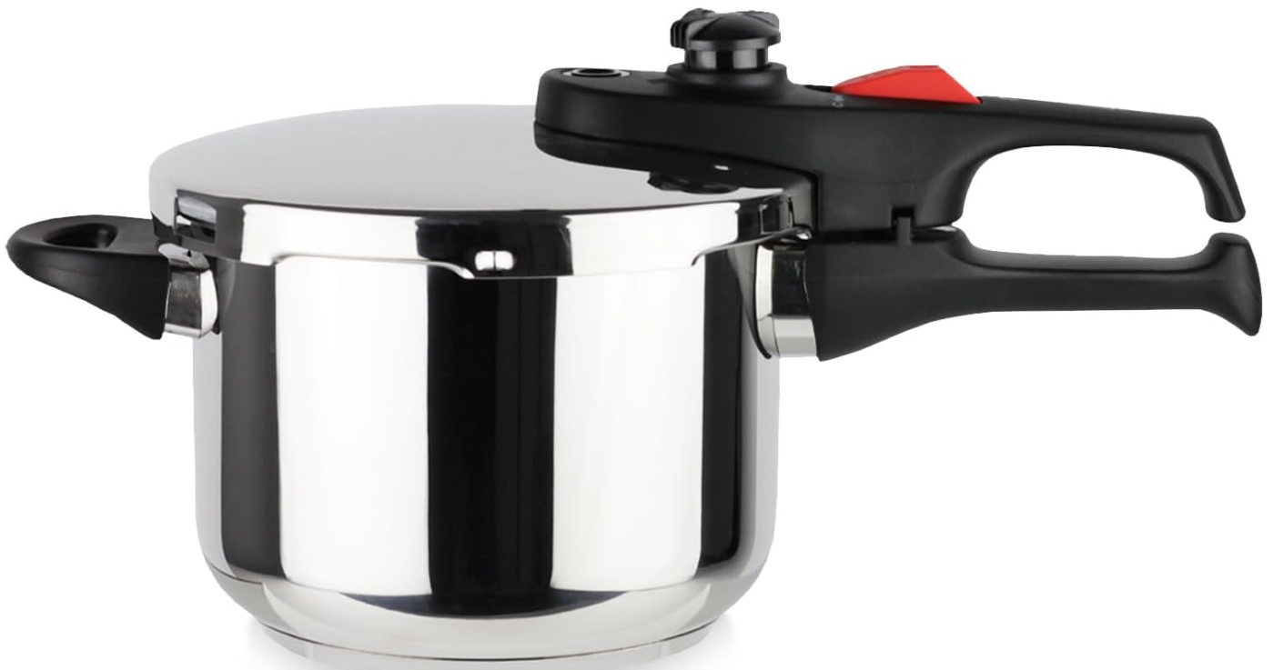
Image: The Magefesa Practika Plus 3.4-Quart Pressure Cooker, showcasing its sleek stainless steel design and ergonomic handles.

The Magefesa Practika Plus pressure cooker is designed for efficient and safe cooking, preserving nutrients and flavors. This manual provides essential information for the proper use, maintenance, and care of your 3.4-quart pressure cooker.