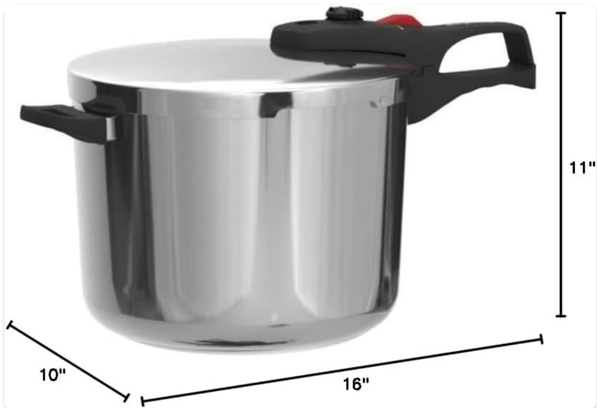
Figure 8: Product dimensions.