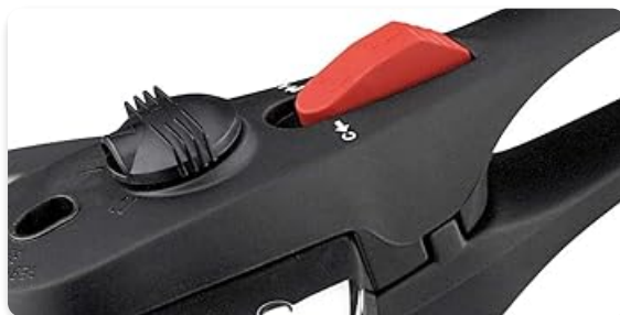
Figure 4: Pressure control system with two cooking levels.