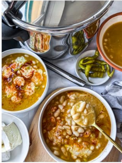
Figure 7: The pressure cooker is made from durable 18/10 stainless steel.