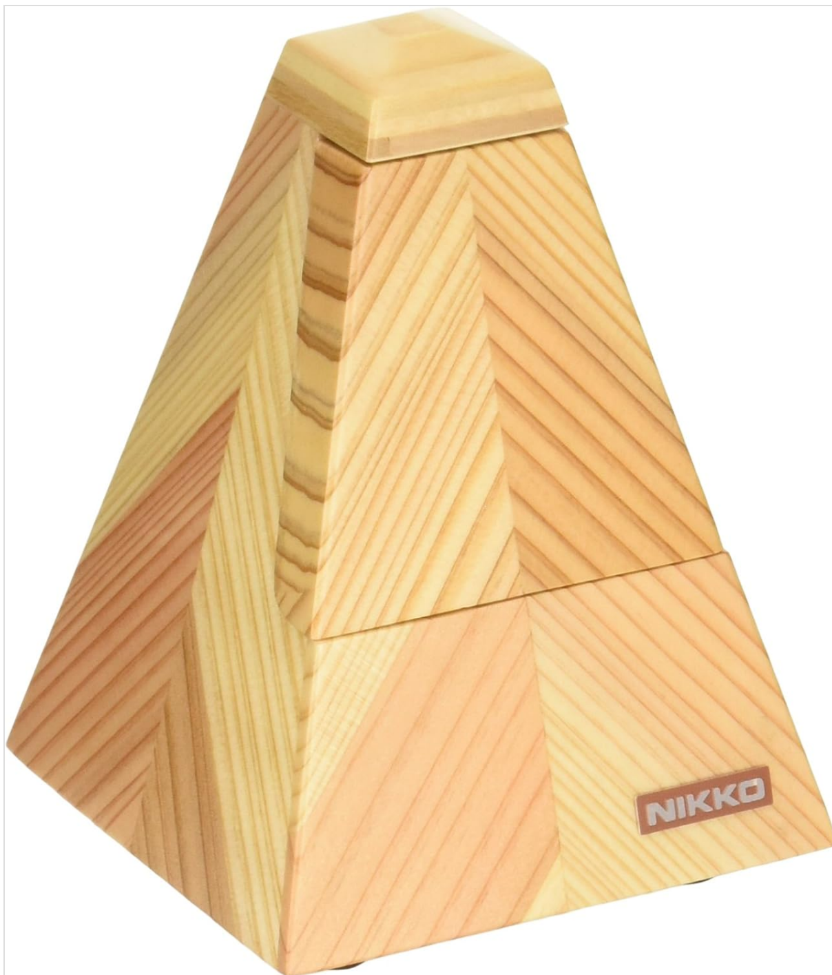
Image: A front view of the Nikko Metronome Model 610, highlighting its wooden construction and the NIKKO brand logo.

stops. Replace the protective cover when not in use.