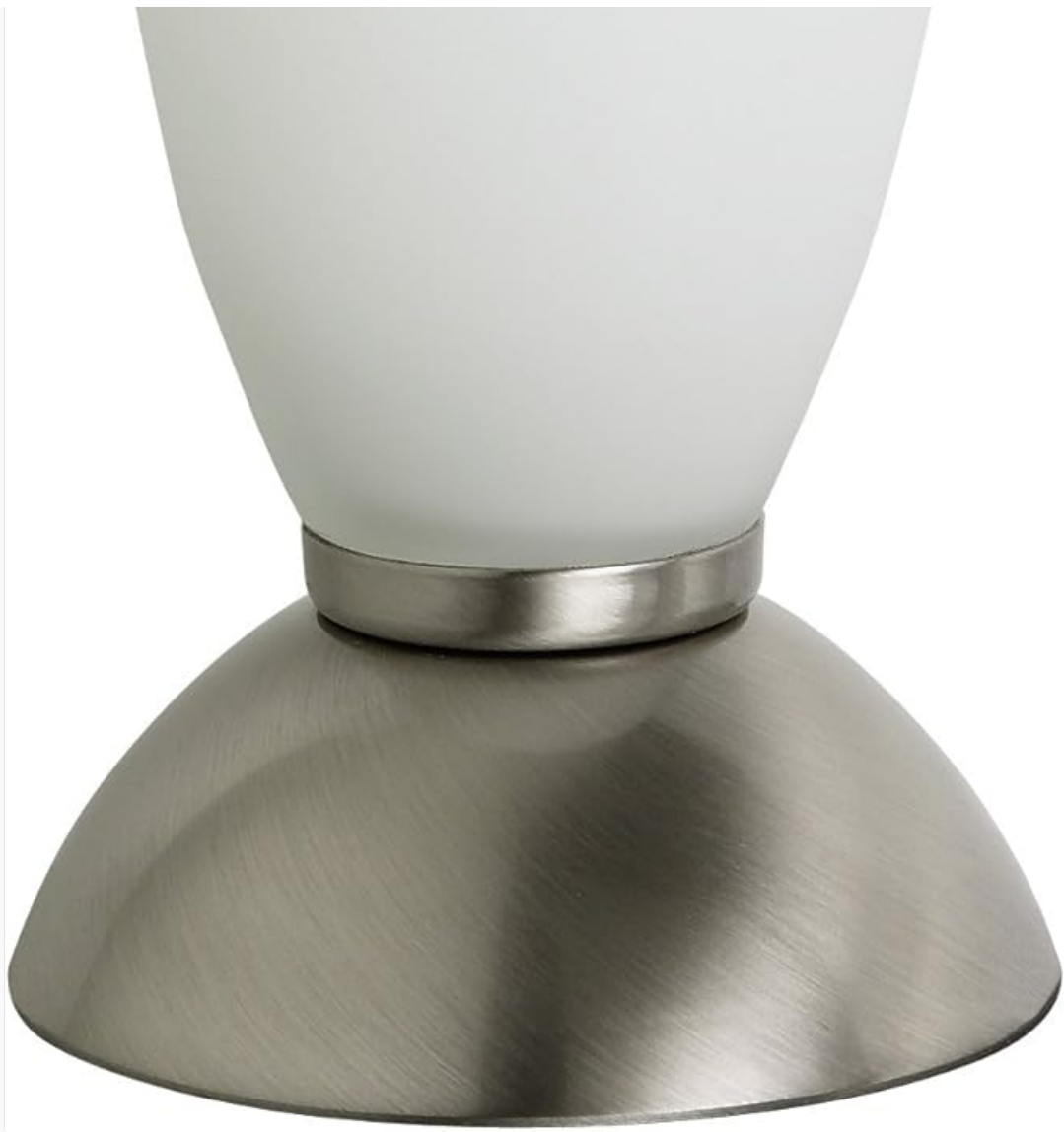
Image 1: The Paul Neuhaus 4412-55 Halogen Table Lamp with its steel base and frosted glass shade.