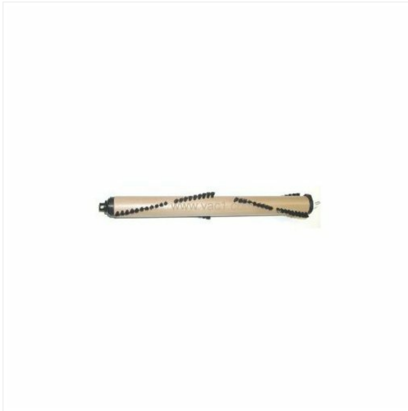
Image: The Kirby Legend and Legend 2 Roller Brush, a cylindrical component with bristles designed for vacuum cleaning.