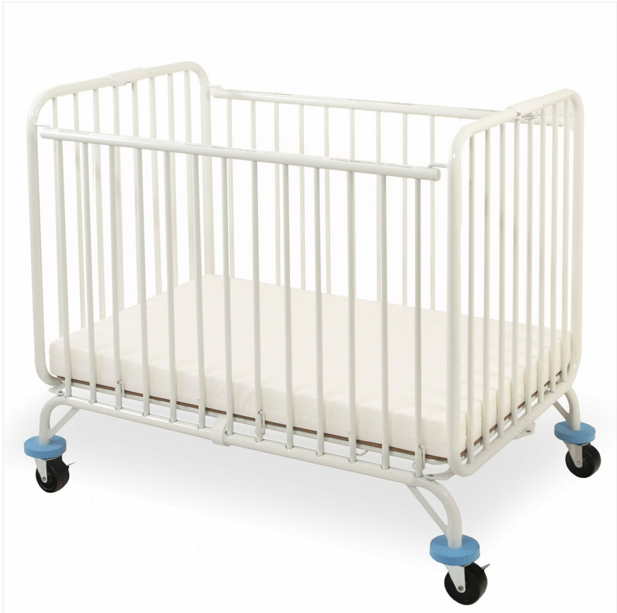
Figure 1: The L.A. Baby Deluxe Holiday Mini/Portable Folding Metal Crib in its fully assembled state.