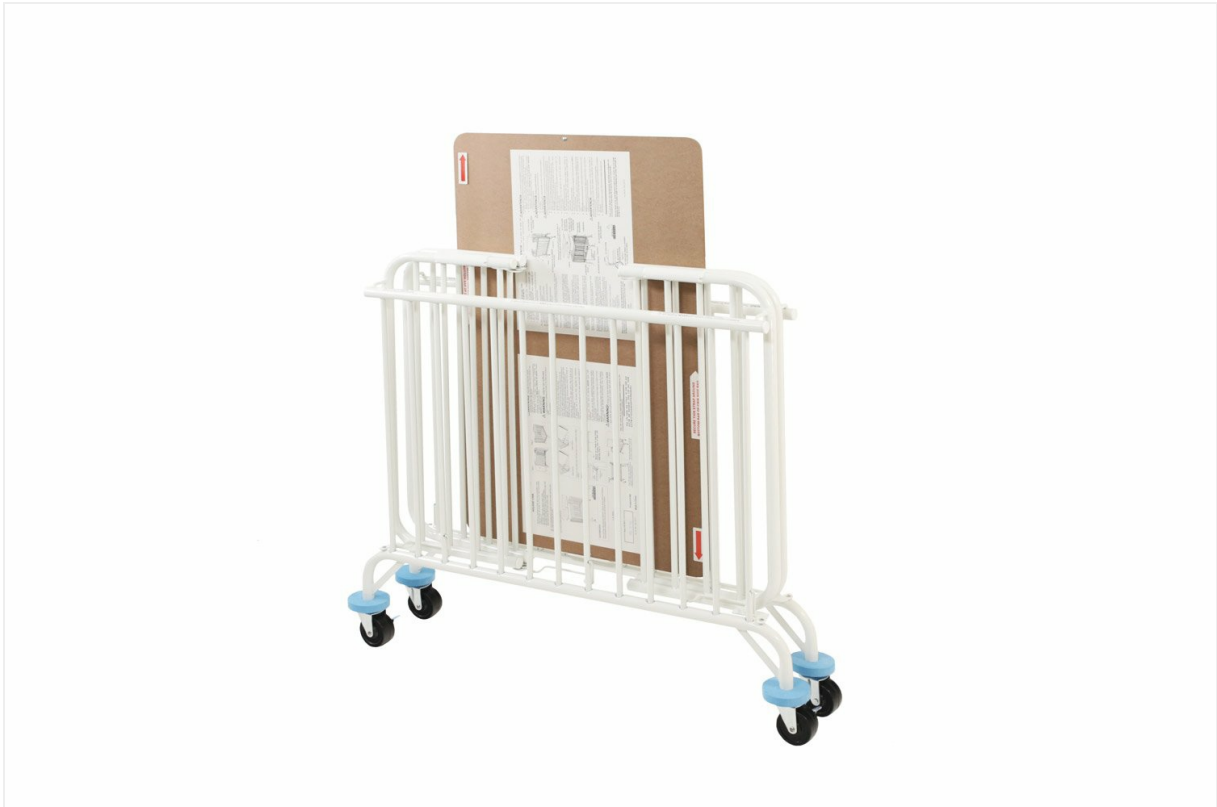
Figure 2: The crib in its compact folded position, ideal for storage.