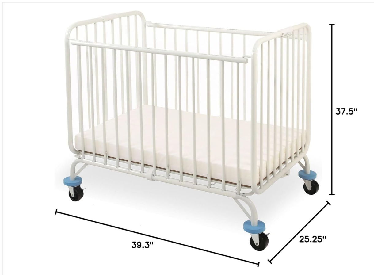
Figure 8: Product dimensions.