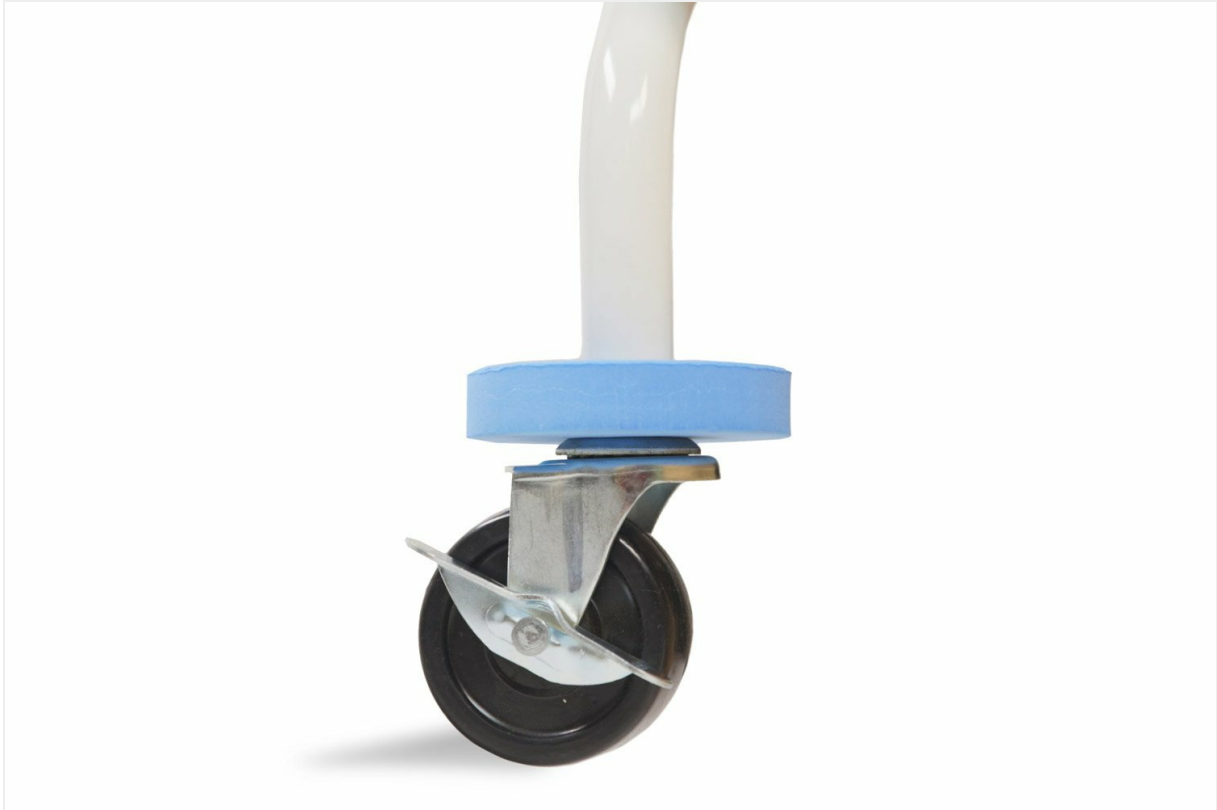
Figure 5: Detail of the caster wheel with protective bumper and locking function.

The crib is equipped with heavy-duty casters for easy mobility. Each wheel includes a locking mechanism to secure the crib in place. To engage the lock, press down on the lever located on each caster. To disengage, lift the lever. Always ensure all wheel locks are engaged when the crib is stationary and in use.