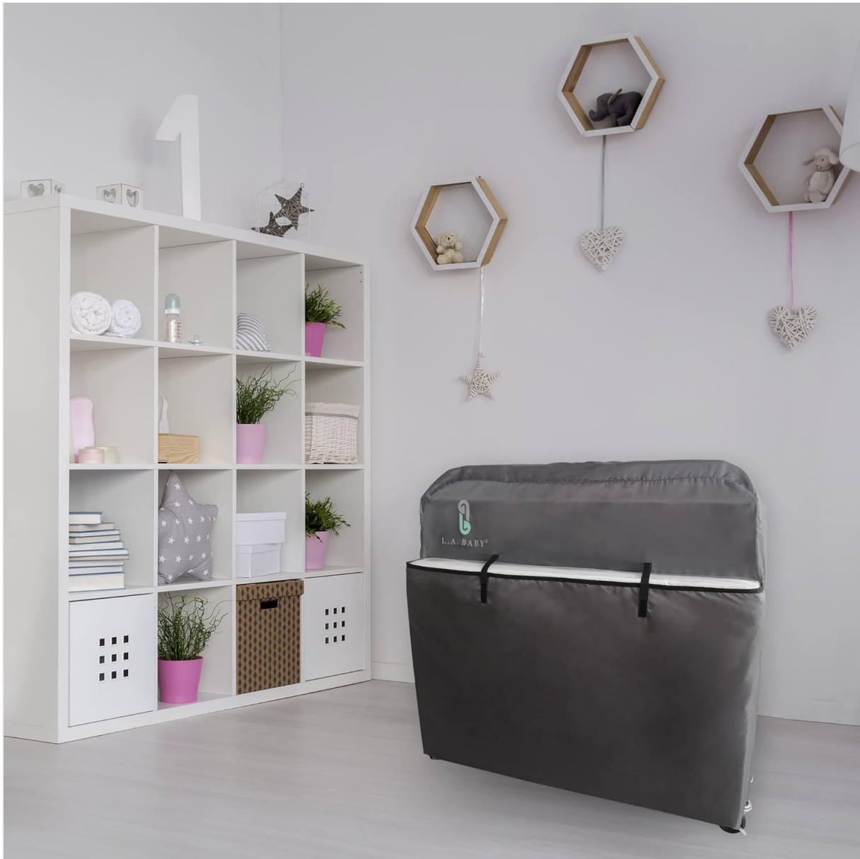
Figure 7: Folded crib with cover, demonstrating compact storage.