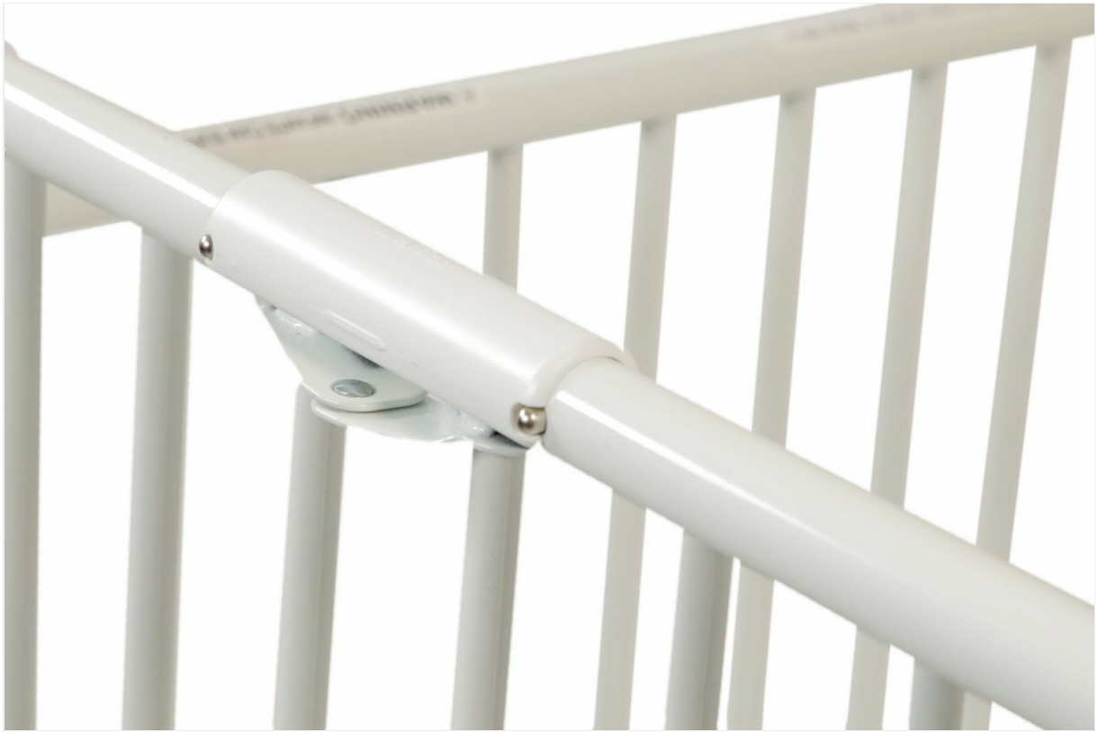
Figure 3: Detail of the hinge mechanism that allows the crib to fold and unfold.