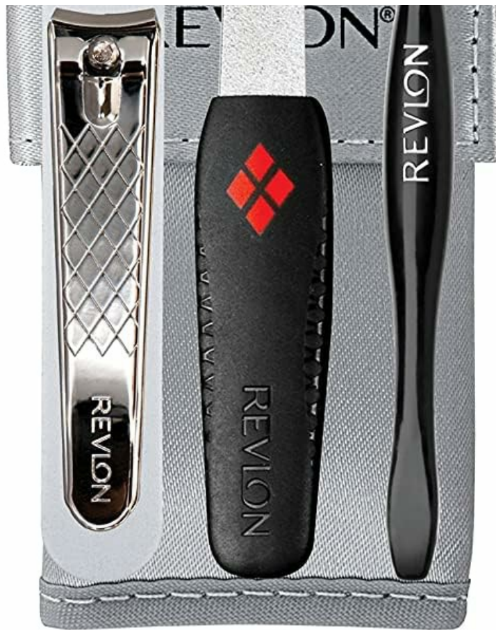
Image: The Revlon Manicure To Go 4 Piece Set, featuring the compact carrying case and the four included tools: a dual-ended cuticle trimmer, a curved blade nail clip, a compact Emeryl file, and a buffer.