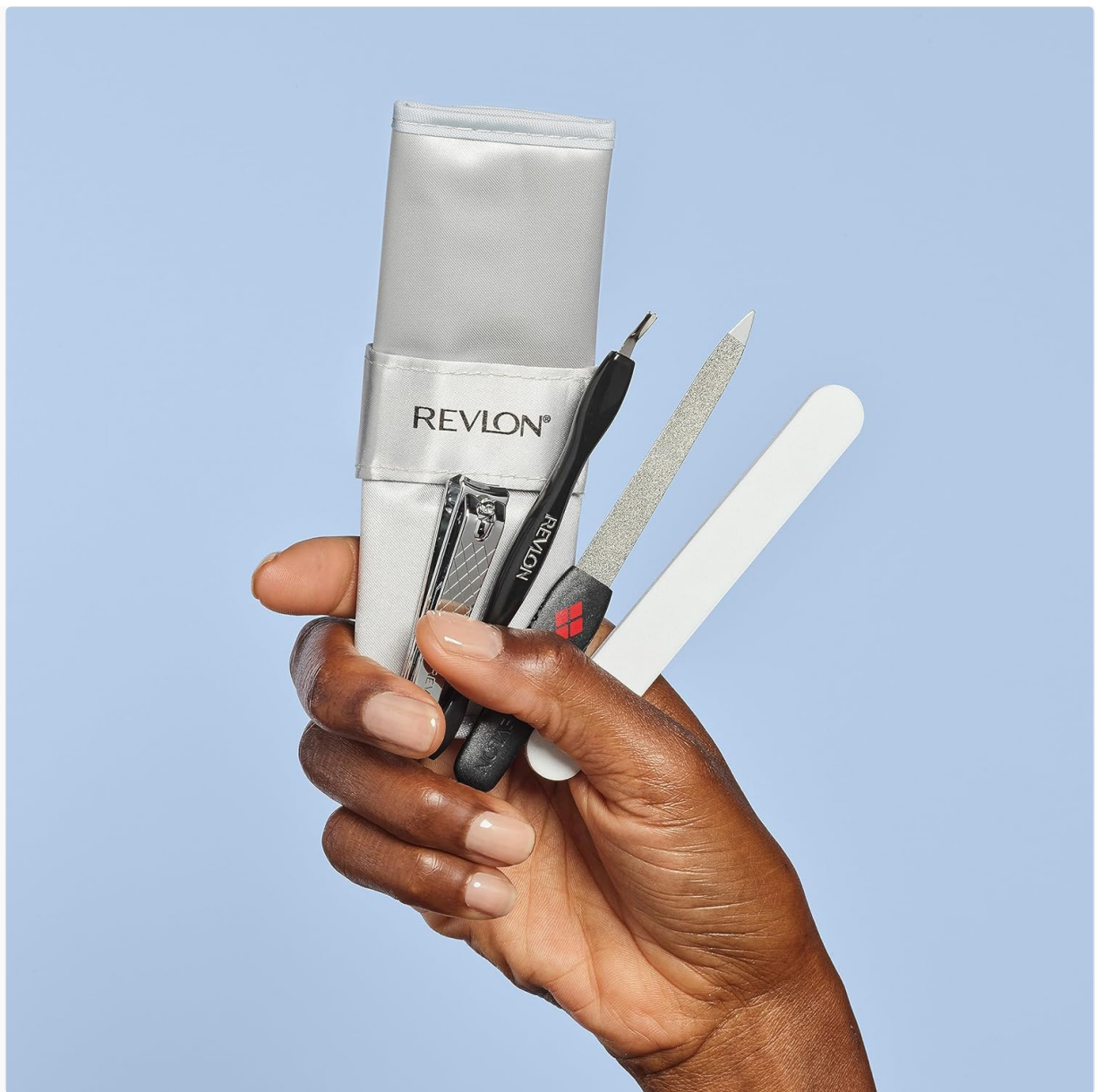
Image: The compact Revlon Manicure To Go set, demonstrating its portable size when held in a hand.