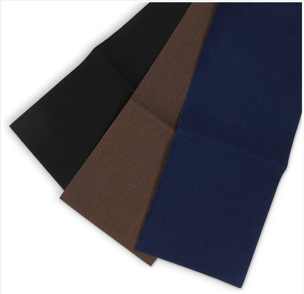
Image 2.1: The mending tape pieces laid flat, illustrating their size and texture before being cut to shape.

paper underneath the hole before applying the patch to prevent sticking to the ironing surface.