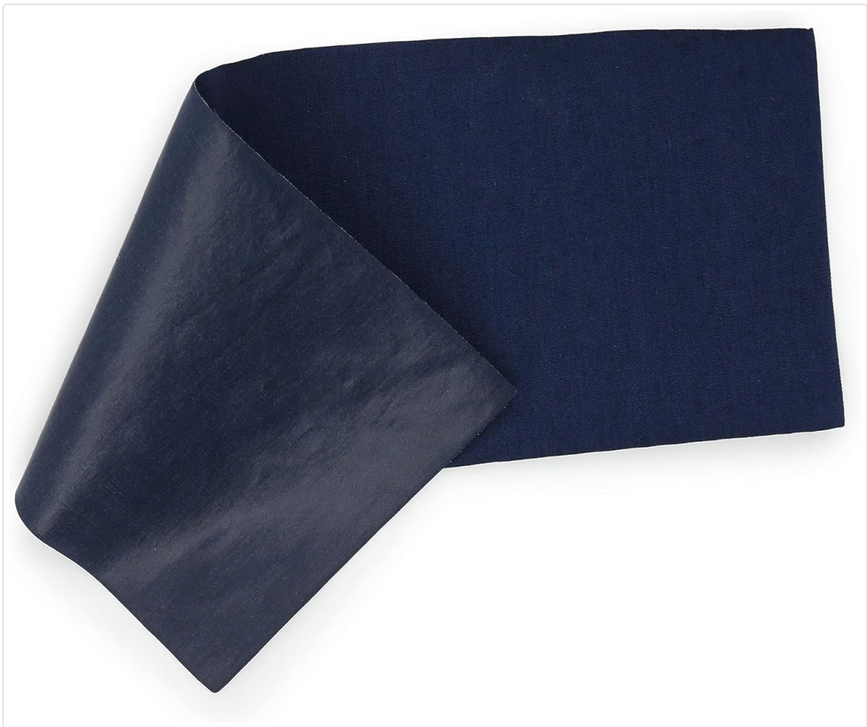
Image 3.1: A close-up view of the mending tape, highlighting the shiny adhesive side that should face down during application.