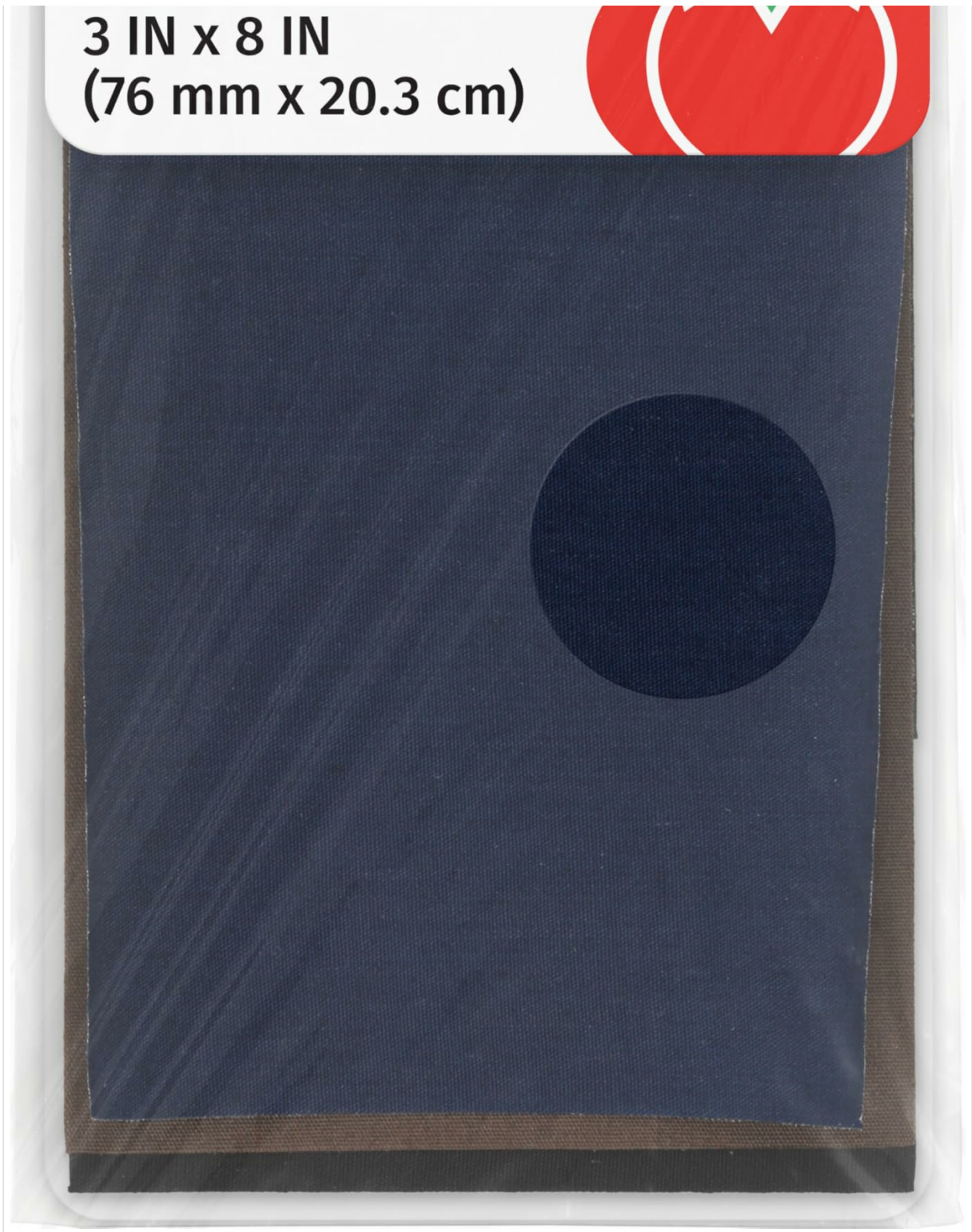
Image 1.1: Dritz Iron-On Mending Tape in black, brown, and navy colors, each measuring 3x8 inches.