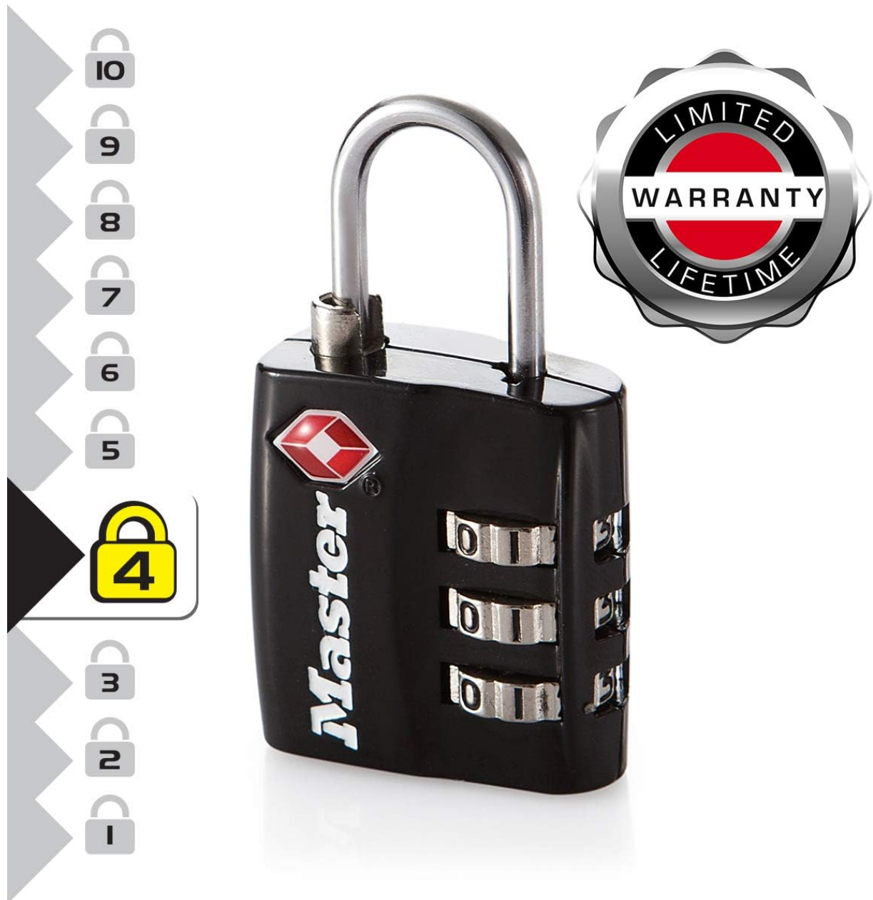
Image: A close-up view of the Master Lock 4680EURDBLK, highlighting the combination dials set to '0-0-0' and indicating the location of the reset mechanism on the side.

It is recommended to write down your combination and store it in a secure, memorable place.