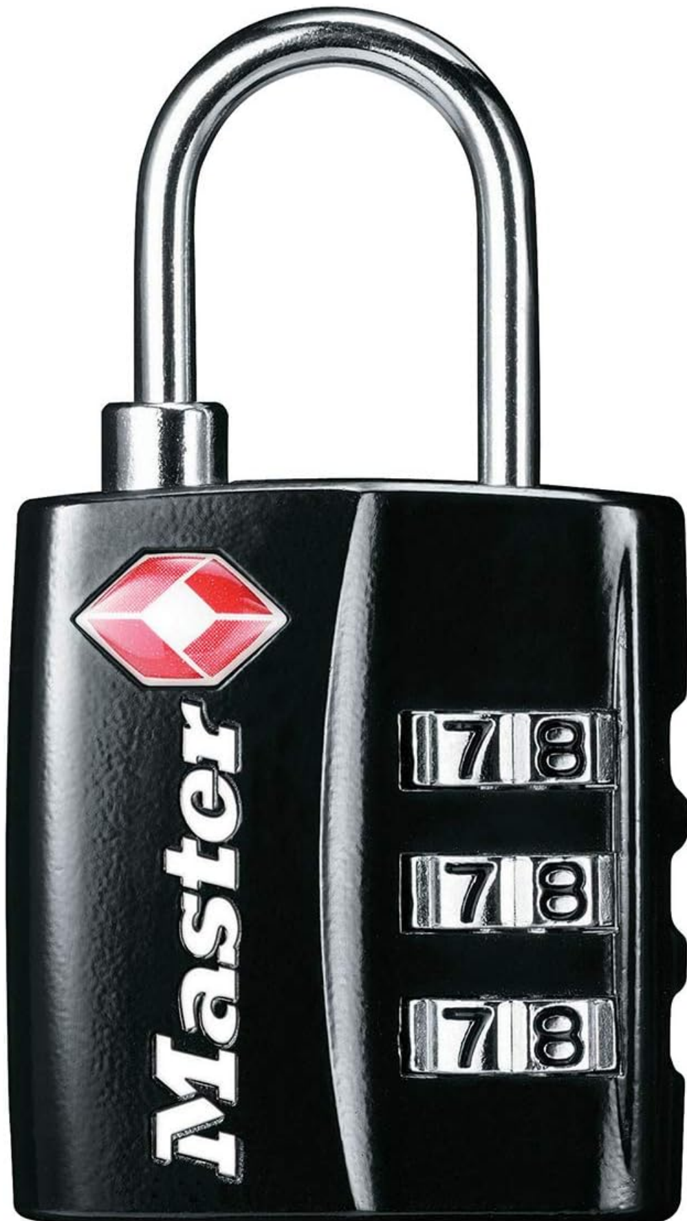
Image: Front view of the Master Lock 4680EURDBLK Combination Travel Padlock, displaying the Master Lock logo and TSA Accepted symbol.