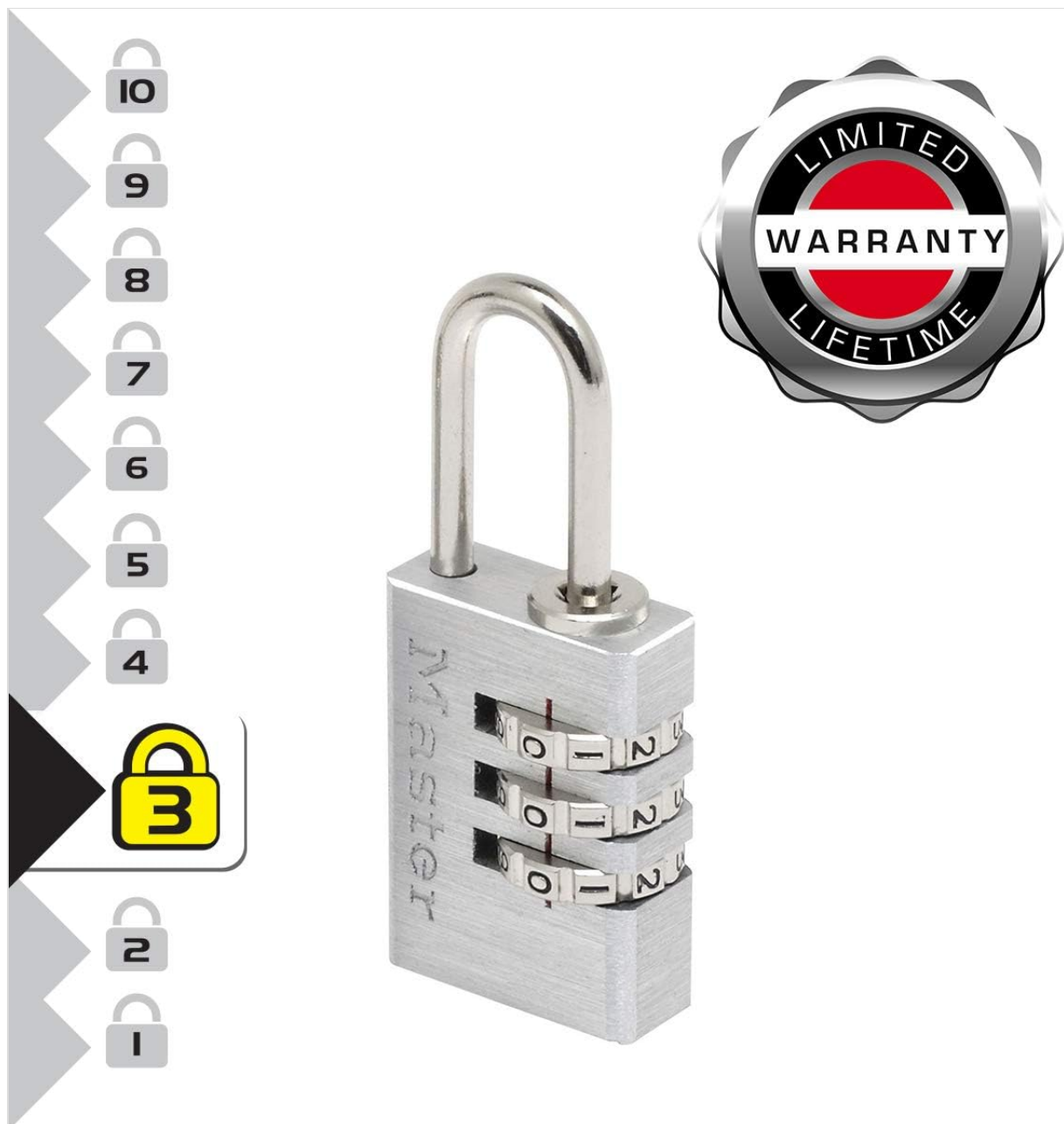
Figure 3: Side view of the padlock, showing the shackle and body.