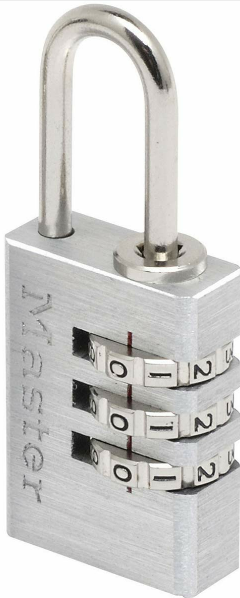
Figure 1: Master Lock 20mm 3-Digit Combination Padlock securing luggage.