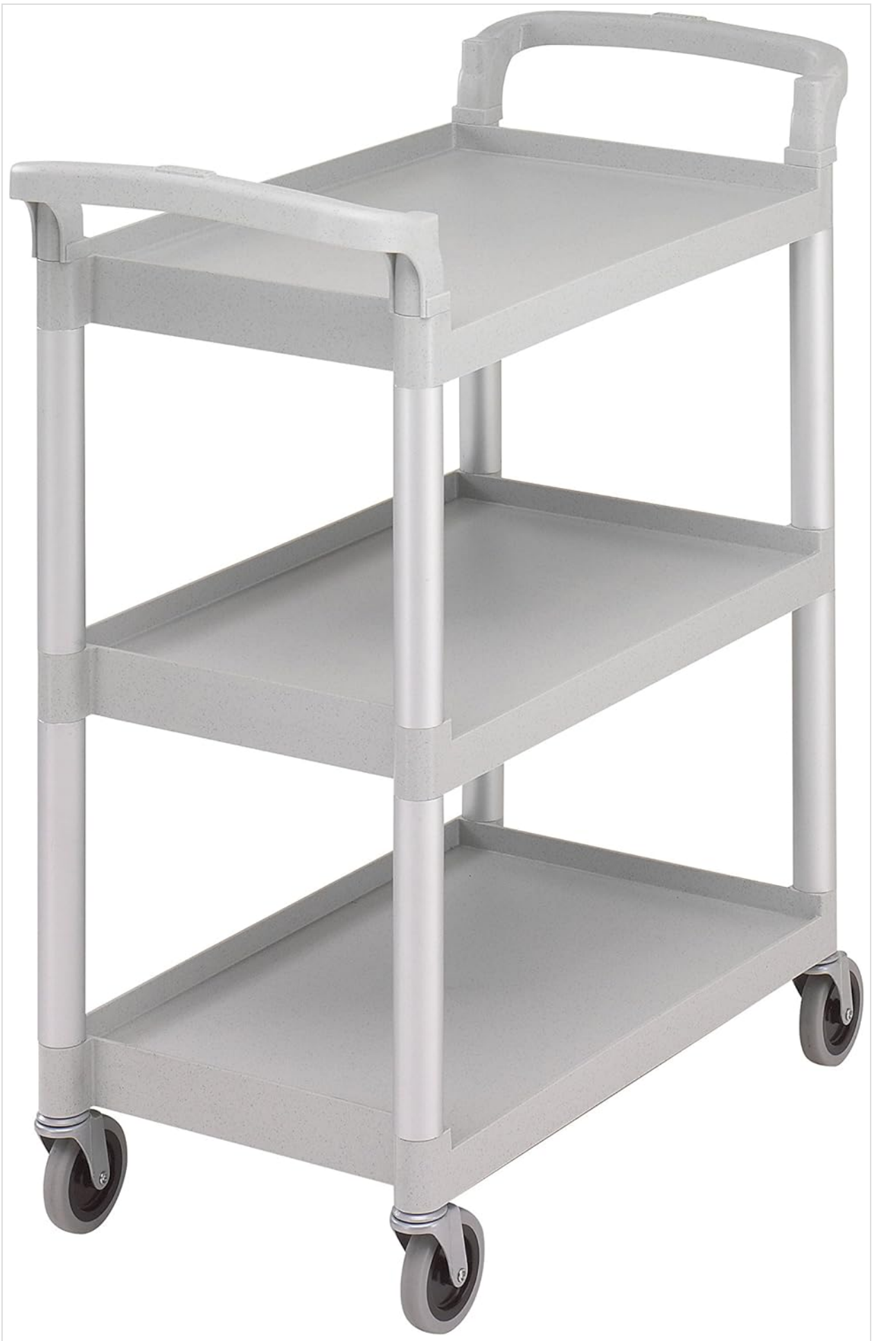
This image displays the Cambro Utility and Service Cart, a three-shelf mobile unit designed for various transport and storage needs. The cart features a gray finish with sturdy plastic shelves and aluminum uprights, equipped with four swivel casters for mobility.