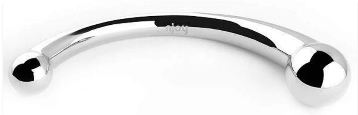
Image 2: Top-down view of the Njoy Pure Wand, illustrating the two distinct spherical ends.