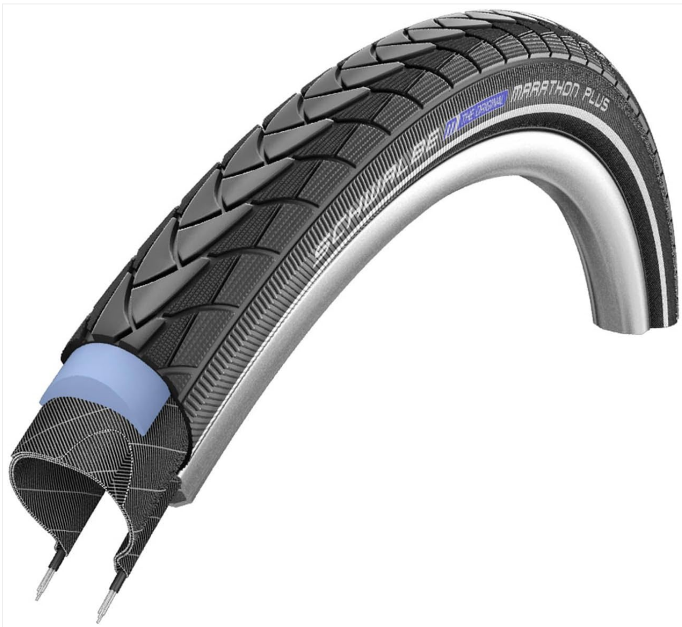
Image: A cross-section view of the SCHWALBE Marathon Plus tire, highlighting the SmartGuard puncture protection layer (blue section) beneath the tread.