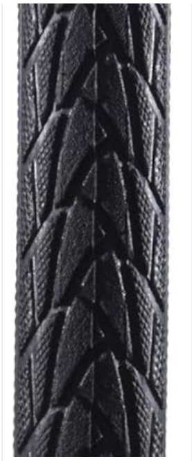
Image: Close-up view of the SCHWALBE Marathon Plus tire's robust tread pattern, designed for durability and grip.