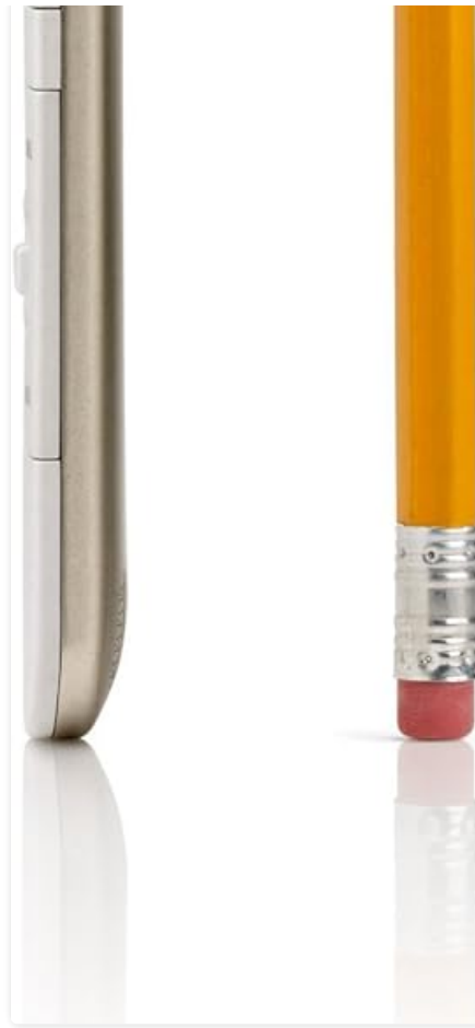
Image: The Kindle's slim design is highlighted by its comparison to a standard pencil.