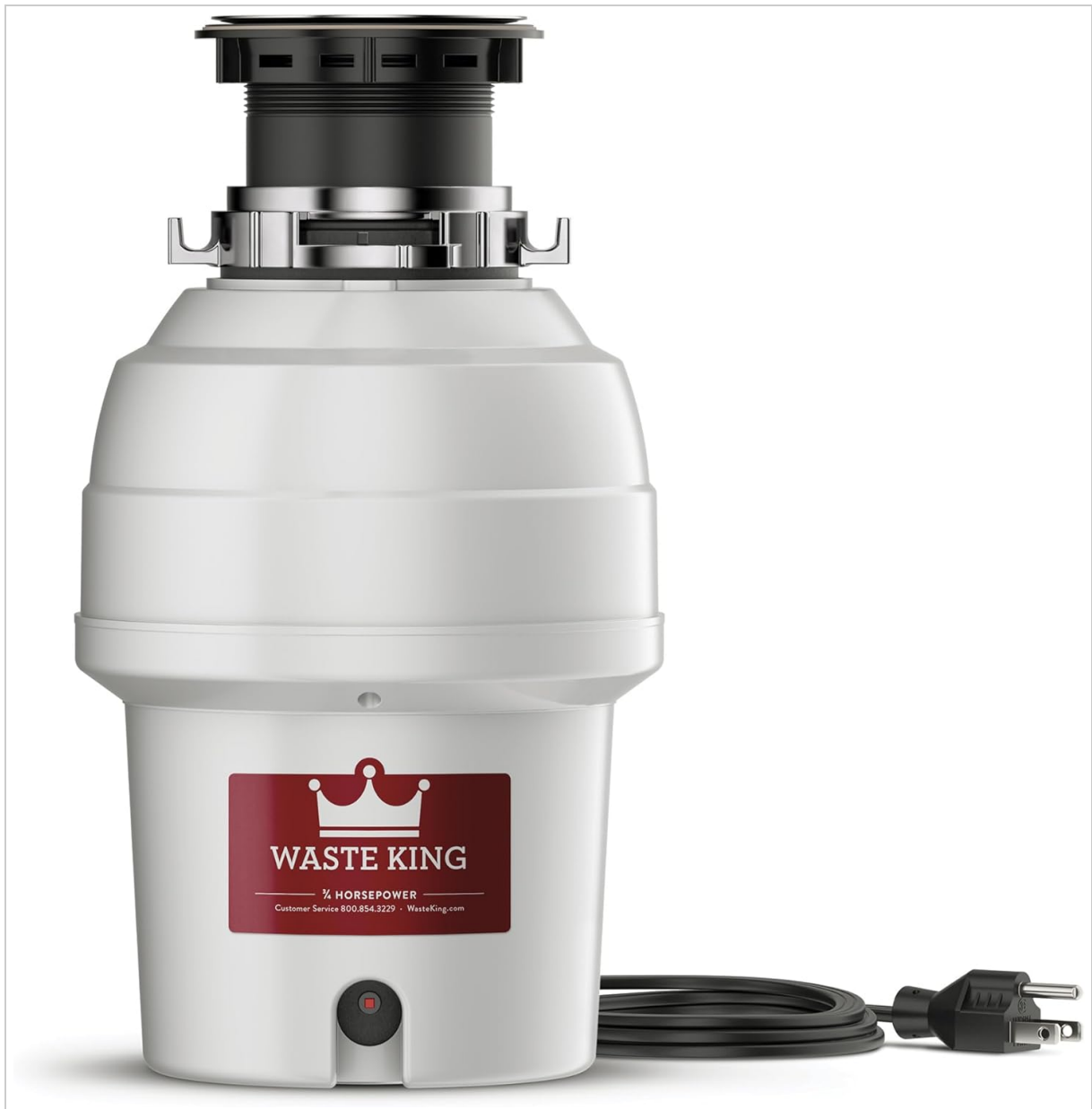
Waste King L-3200 3/4 HP Continuous Feed Garbage Disposal with pre-installed power cord.