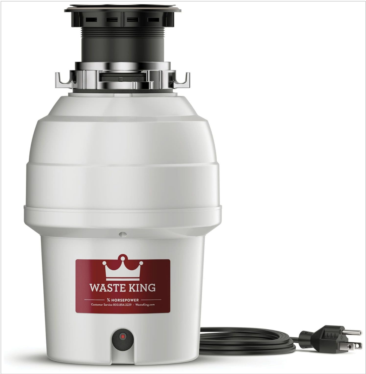
Location of the front-mounted power reset button for easy access.