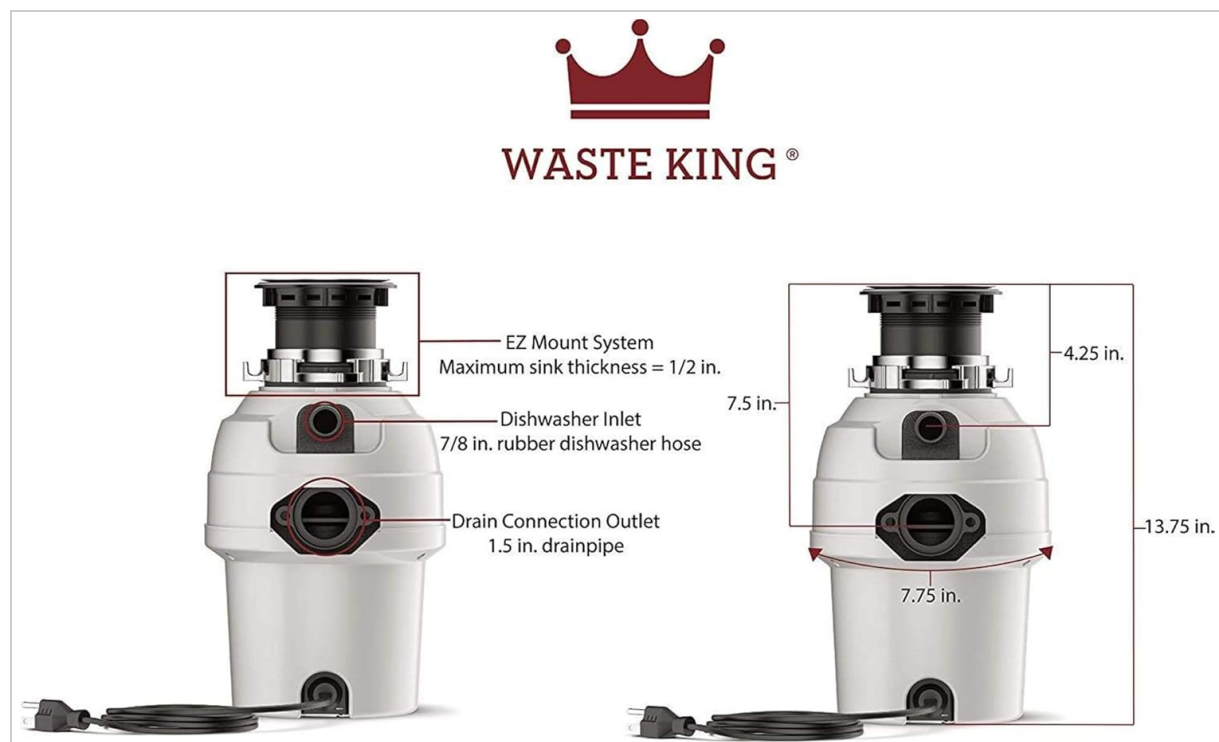
Diagram of the EZ Mount Twist-and-Lock system for simplified installation.