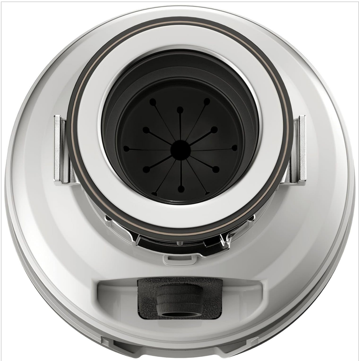
Top view of the Waste King L-3200 grinding chamber, showing the splashguard.