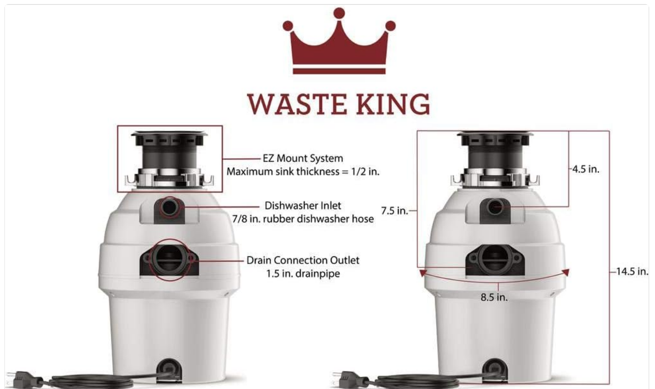
Figure 2: Dimensions and connection points of the Waste King L-3300 Garbage Disposal.