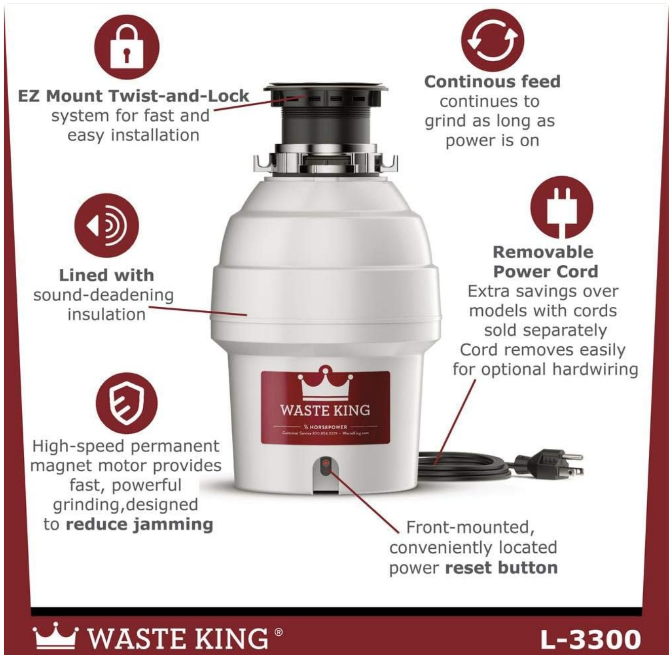
Figure 1: Waste King L-3300 Garbage Disposal highlighting its main features.