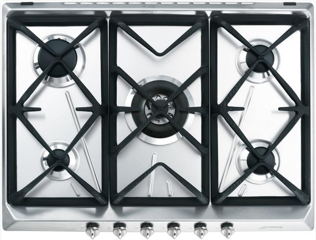
Image 1: Top-down view of the Smeg SRV576GH5 gas hob. This image shows the layout of the five gas burners, including a central wok burner, and the robust cast iron pan supports. The stainless steel surface is also visible.

Ensure the countertop opening dimensions are accurate for the hob's fit. Refer to the installation template provided with the product for precise measurements. The hob dimensions are approximately 68.5 cm x 50 cm x 3.2 cm.