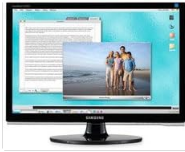
Figure 5.2: The Samsung SyncMaster 2253LW monitor displaying a typical computer desktop environment. The screen shows multiple open windows, including a document editor and an image viewer displaying a family photo on a beach, demonstrating the monitor's capability for multitasking and media consumption.