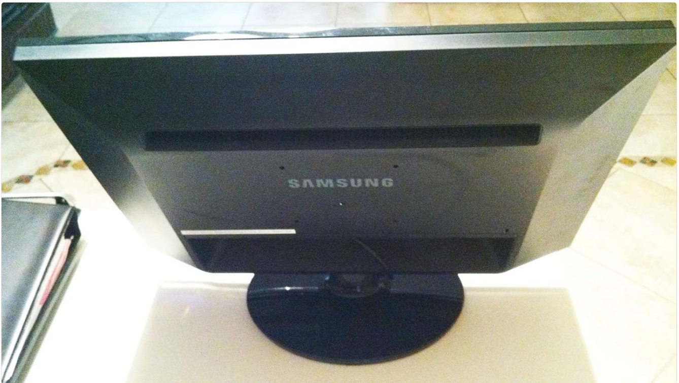
Figure 4.1: Rear view of the Samsung SyncMaster 2253LW LCD monitor. This image shows the back of the monitor, highlighting the VESA mount holes for wall mounting and the recessed area where the input ports (VGA, DVI, power) are typically located. The Samsung logo is prominently displayed in the center.

Before connecting, ensure both the monitor and your computer are powered off. Connect the appropriate video cable (VGA or DVI) from your computer's graphics card to the corresponding input port on the back of the monitor. Then, connect the power cable to the monitor and a wall outlet.