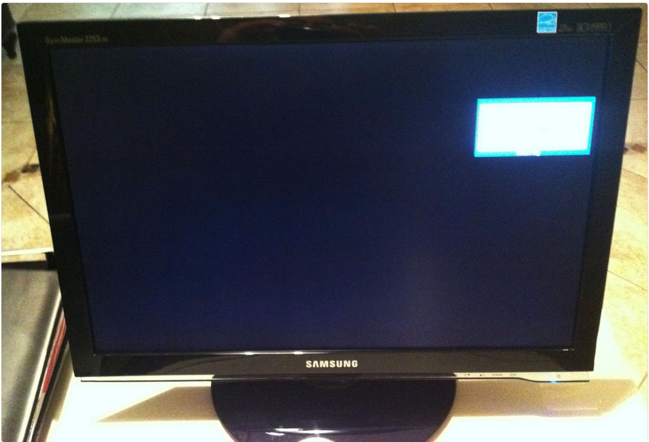
Figure 1.1: Front view of the Samsung SyncMaster 2253LW LCD monitor. This image displays the monitor from the front, showcasing its sleek black bezel and the Samsung logo centered on the bottom frame. The screen is dark, indicating it is powered off or in standby mode, with a small blue rectangle visible on the screen, likely a signal indicator.

The Samsung SyncMaster 2253LW is a 54.9 cm (21.6-inch) LCD monitor designed for various computing tasks, offering a clear display and user-friendly features.