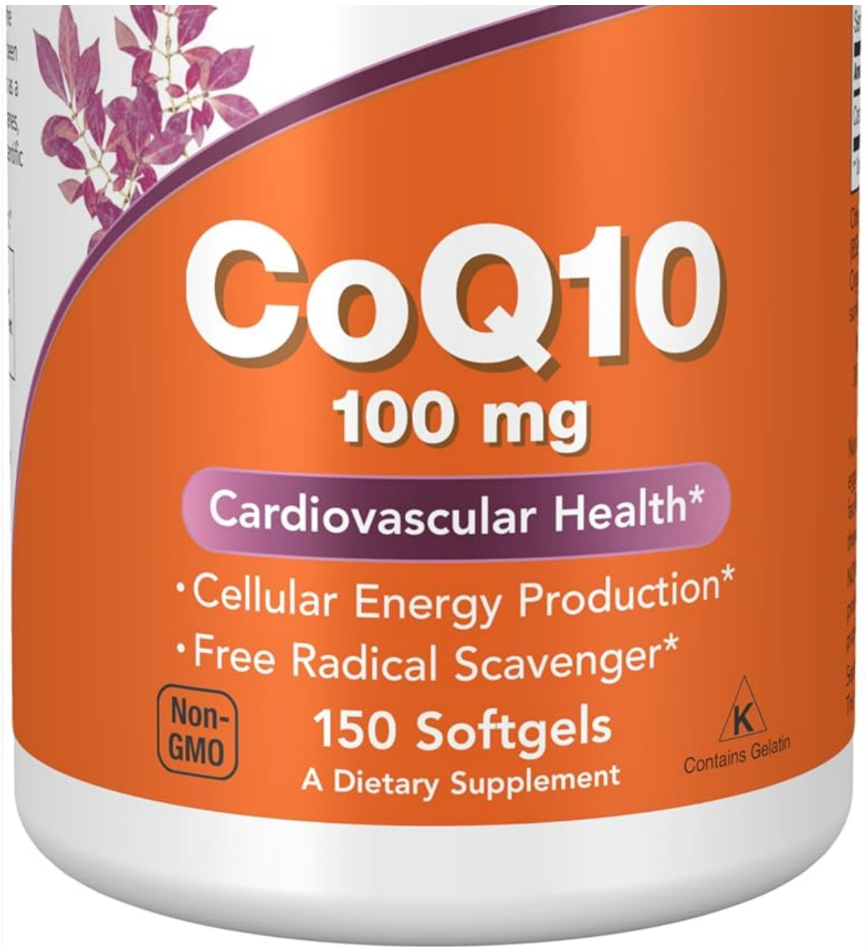
Image 1: Front view of the NOW Foods CoQ10 100 mg Softgels bottle, highlighting its key benefits for cellular energy production and cardiovascular health.