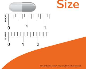
Image illustrating the size of a NOW B-50 capsule with a ruler for scale, indicating it is approximately 1 inch long.