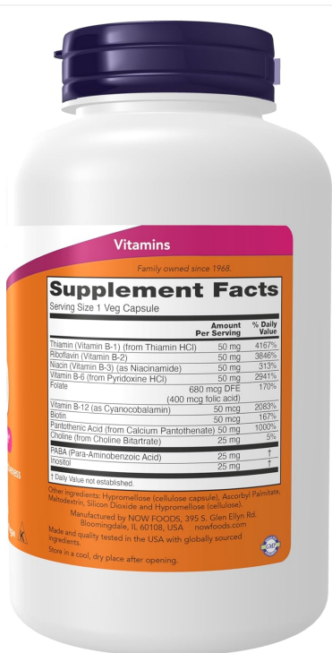
Detailed view of the Supplement Facts label for NOW B-50 Veg Capsules, showing nutrient amounts and daily values.