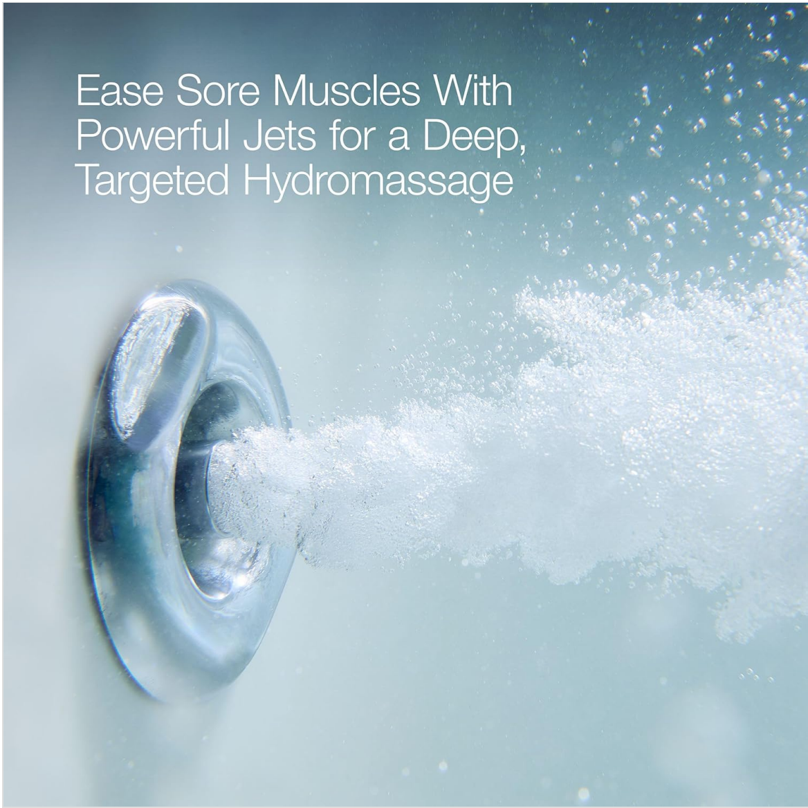
Image: A powerful jet providing a deep, targeted hydromassage.