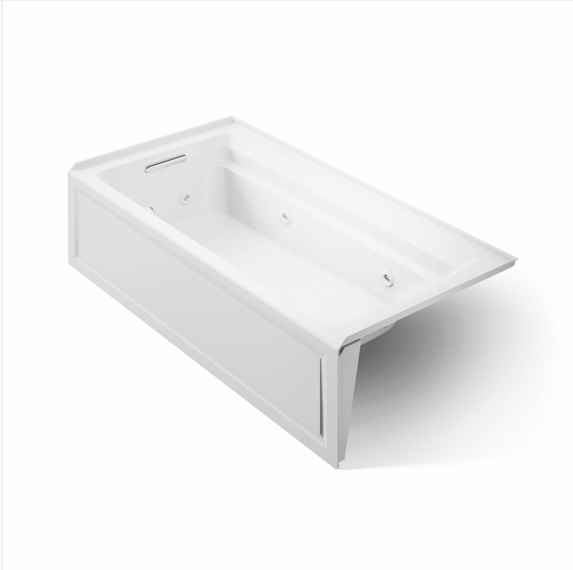
Image: The Kohler K-1124-HL-0 Alcove Whirlpool Tub installed in a contemporary bathroom.