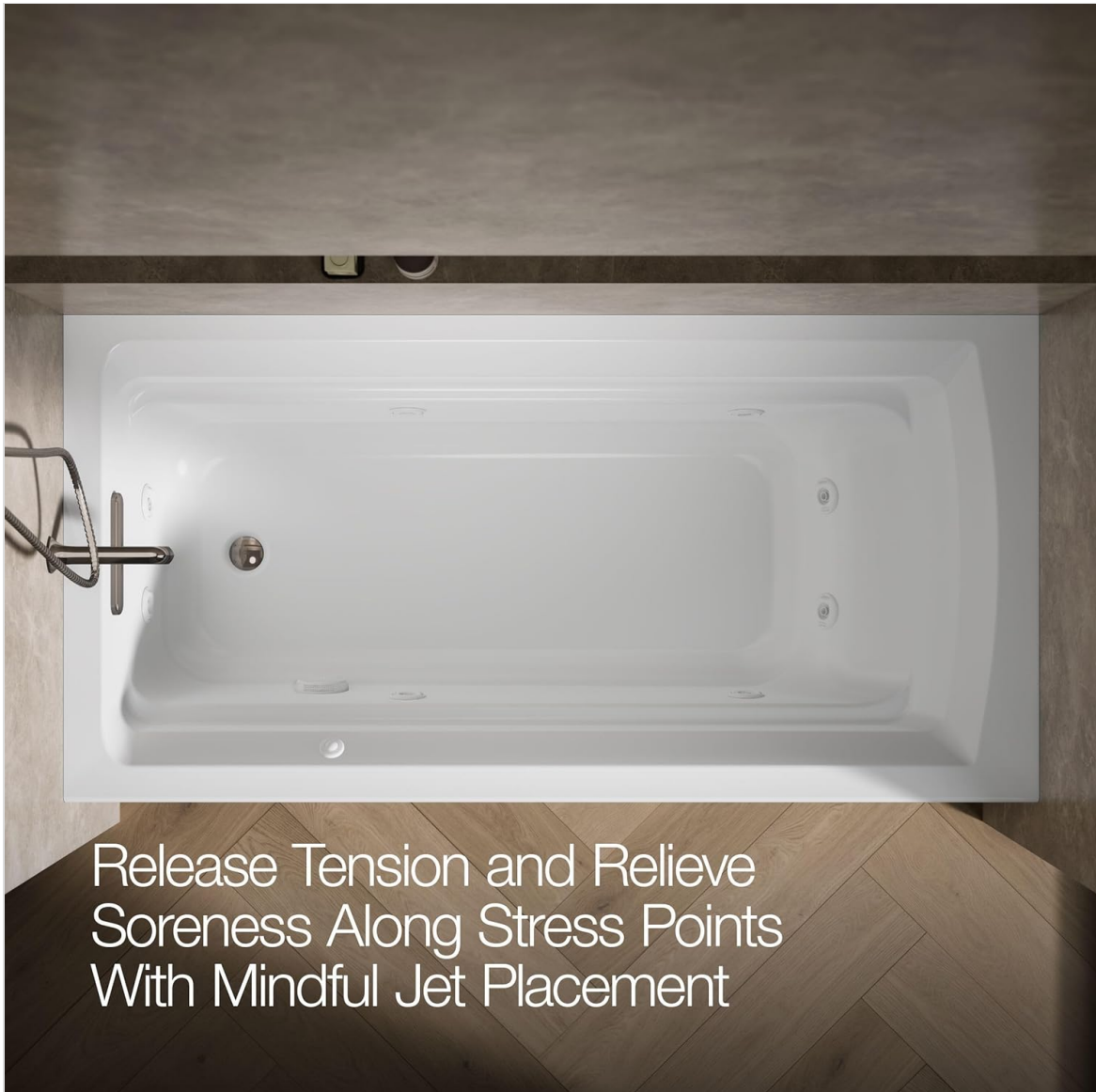
Image: Overhead view illustrating the strategic placement of jets for effective hydro-massage.