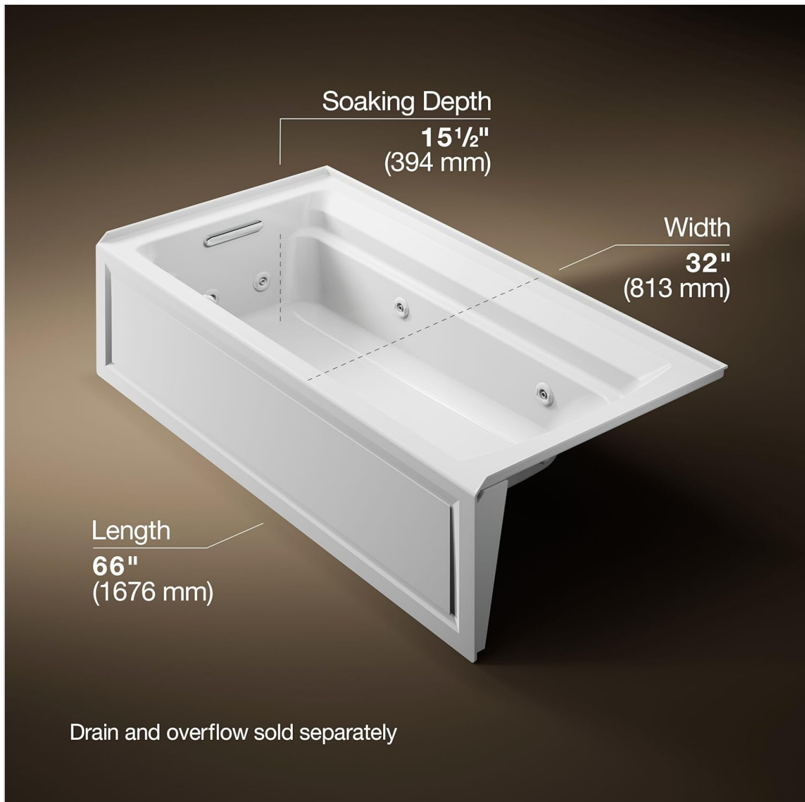
Image: Key dimensions of the Kohler K-1124-HL-0 Alcove Whirlpool Tub.