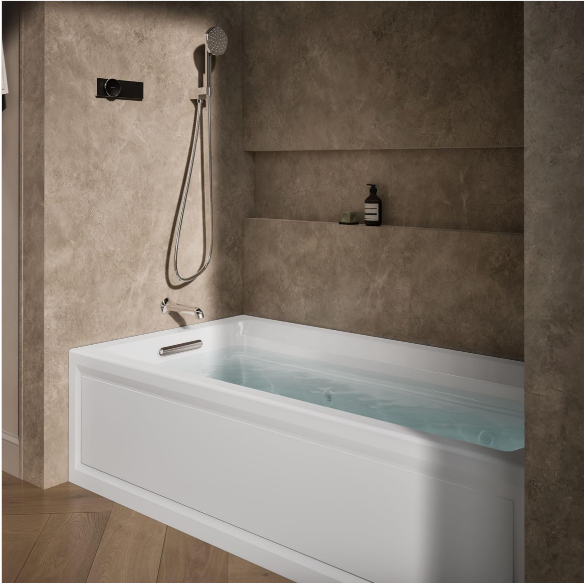
Image: The tub is designed for alcove installation, suitable for a bath and shower combination.

Refer to the detailed installation instructions provided with your product for specific measurements, diagrams, and safety warnings.