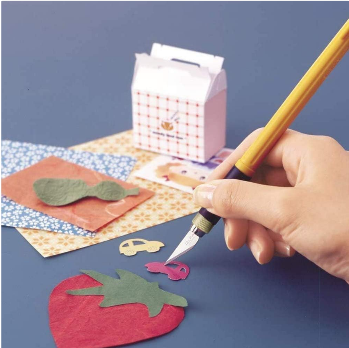
Image 6.1: An example of the OLFA 157B Art Knife being used for precise cutting on craft materials, demonstrating proper grip and application.

Always use a cutting mat to protect your work surface and extend blade life. For optimal control, hold the knife like a pen, ensuring a firm but relaxed grip on the rubberized section.