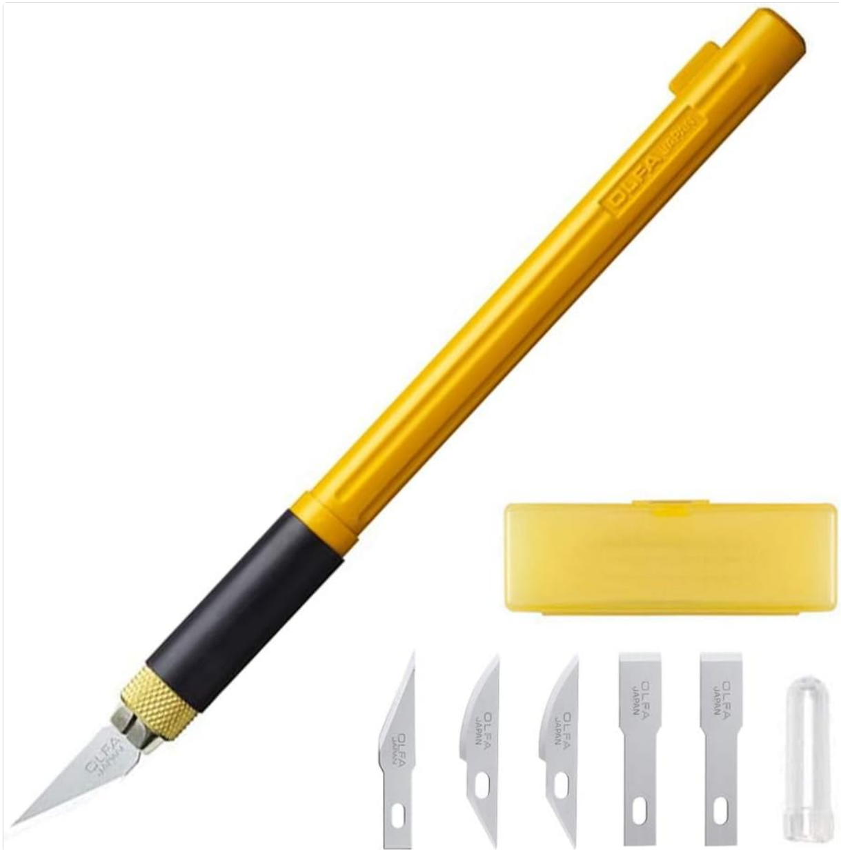
Image 3.1: The OLFA 157B Art Knife set, including the knife handle, three types of blades, and a compact blade storage case.