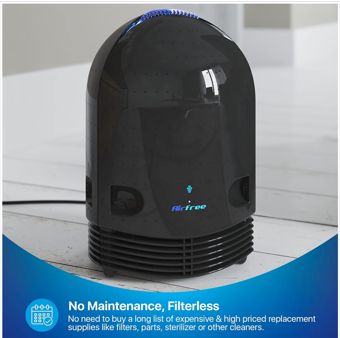
Image 7: The Airfree P3000 emphasizing its filterless design and lack of maintenance needs.