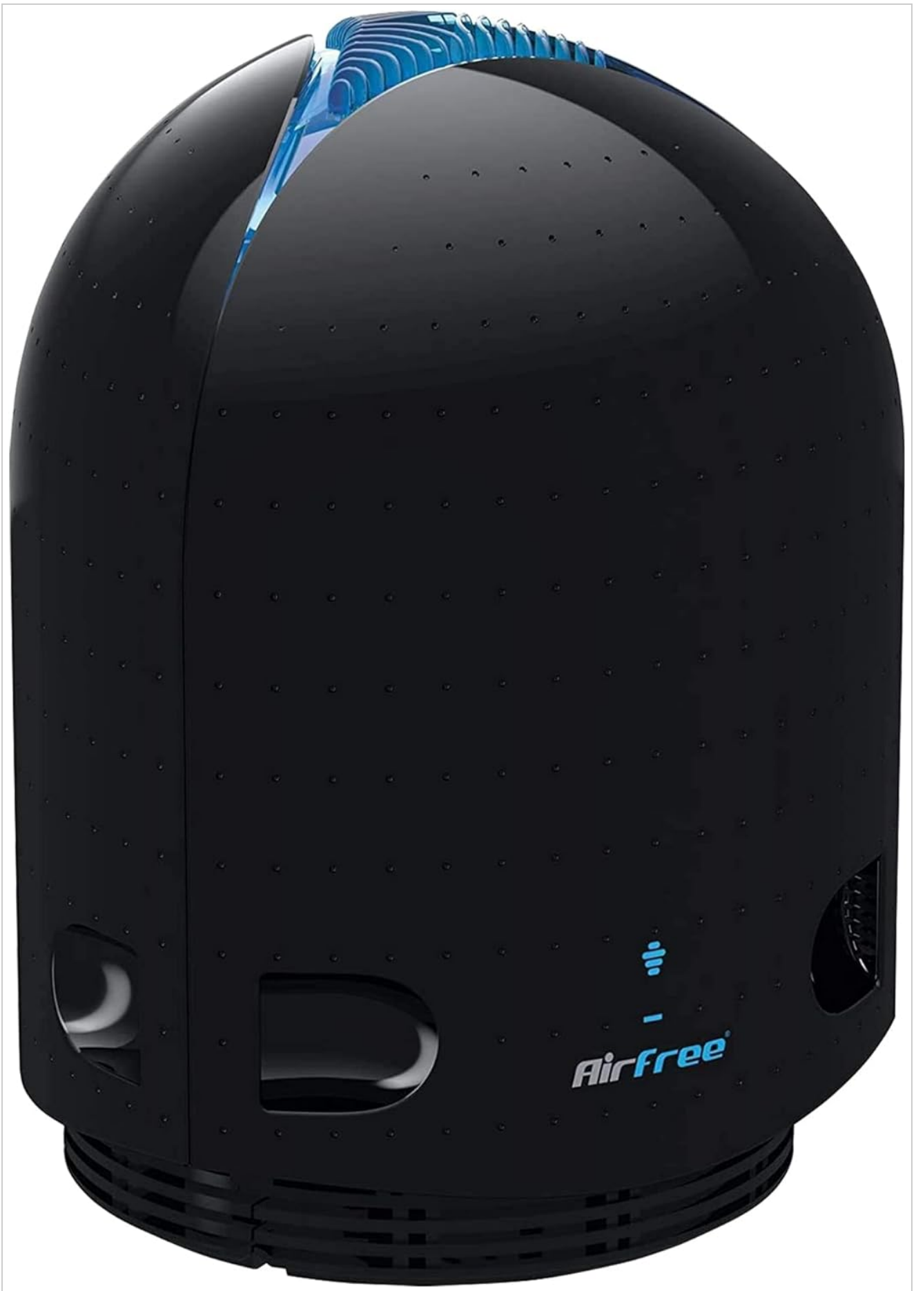
Image 1: The Airfree P3000 Silent Air Purifier, showcasing its sleek black design and the blue light indicator at the top.