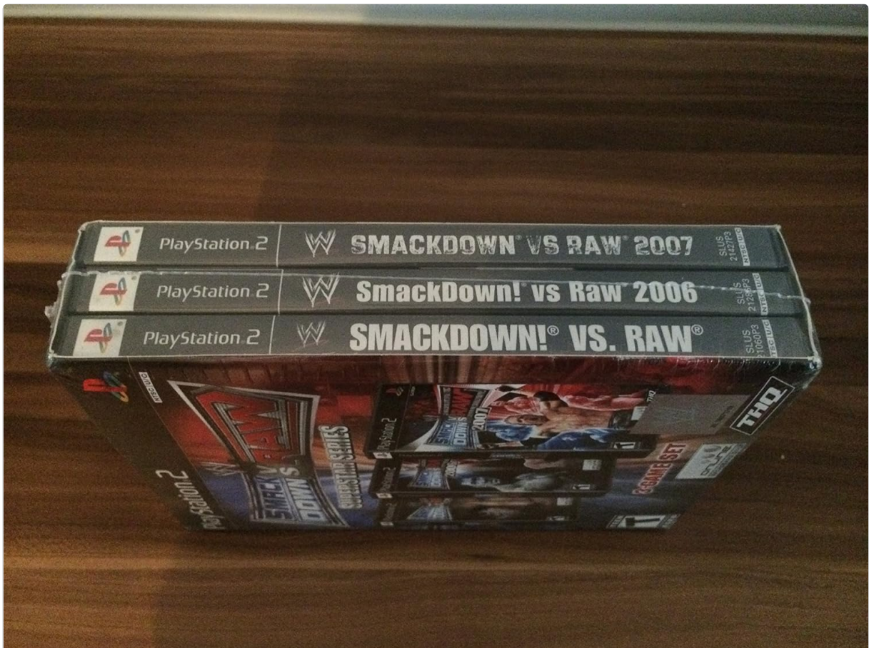
Image 2: Spine view of the three WWE Smackdown vs Raw PlayStation 2 game cases. This image shows the spines of the individual game cases stacked, clearly displaying the titles: WWE Smackdown! vs. Raw 2007, WWE Smackdown! vs.