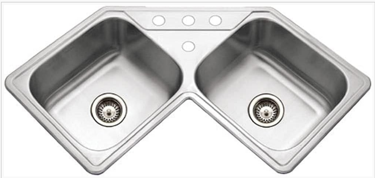
Image 1.1: The Houzer Legend LCR-3221-1 Stainless Steel Corner Kitchen Sink, showcasing its double bowl design and four faucet holes.

The Houzer LCR-3221-1 Legend Series Topmount Corner Bowl Kitchen Sink is designed to maximize usable countertop corner space, featuring two equal bowls constructed from 20-gauge T-304 stainless steel with a lustrous satin finish. It includes four faucet holes and StoneGuard undercoating with a Super Silencer pad to reduce noise during use. This sink meets ASME A112.19.3-2000, UPC, and CSA standards.