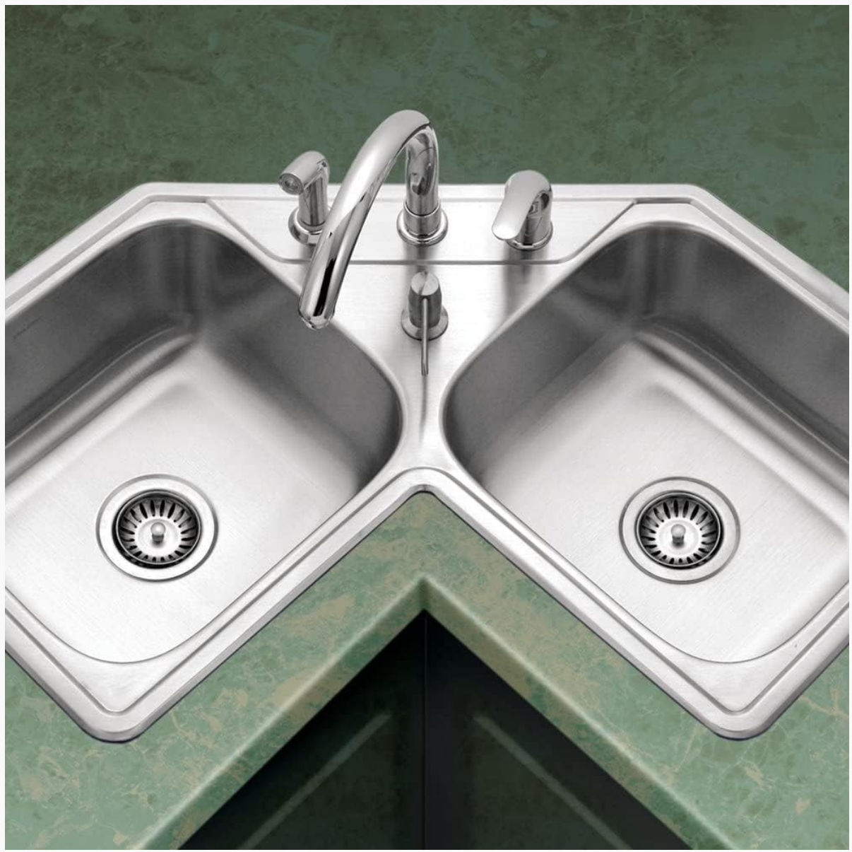
Image 4.2: The Houzer LCR-3221-1 sink installed in a kitchen corner, demonstrating its functional placement.