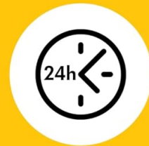
Image: Medela Hydrogel Pads are dermatologically tested, preservative-free, and reusable for up to 24 hours.

Dermatologically tested and preservative-free, the Hydrogel Pads ensure comfort and ease of use throughout the healing process.