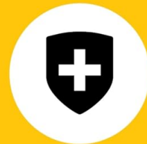
Image: Hydrogel pads prevent bacteria from entering vulnerable skin, offering protection from infection.

Prevents bacteria from entering skin that is sore, cracked, or vulnerable.