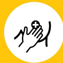
Image: Hydrogel Pads support faster healing, promoting comfortable breastfeeding experiences.

Hydrogel Pads create a moist environment that supports faster healing and promotes the growth of new skin tissue.