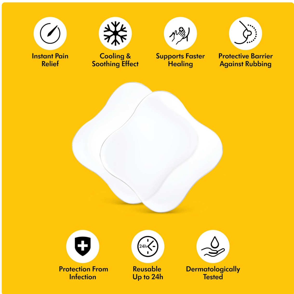
Image: Visual representation of the multiple benefits offered by Medela Hydrogel Pads.