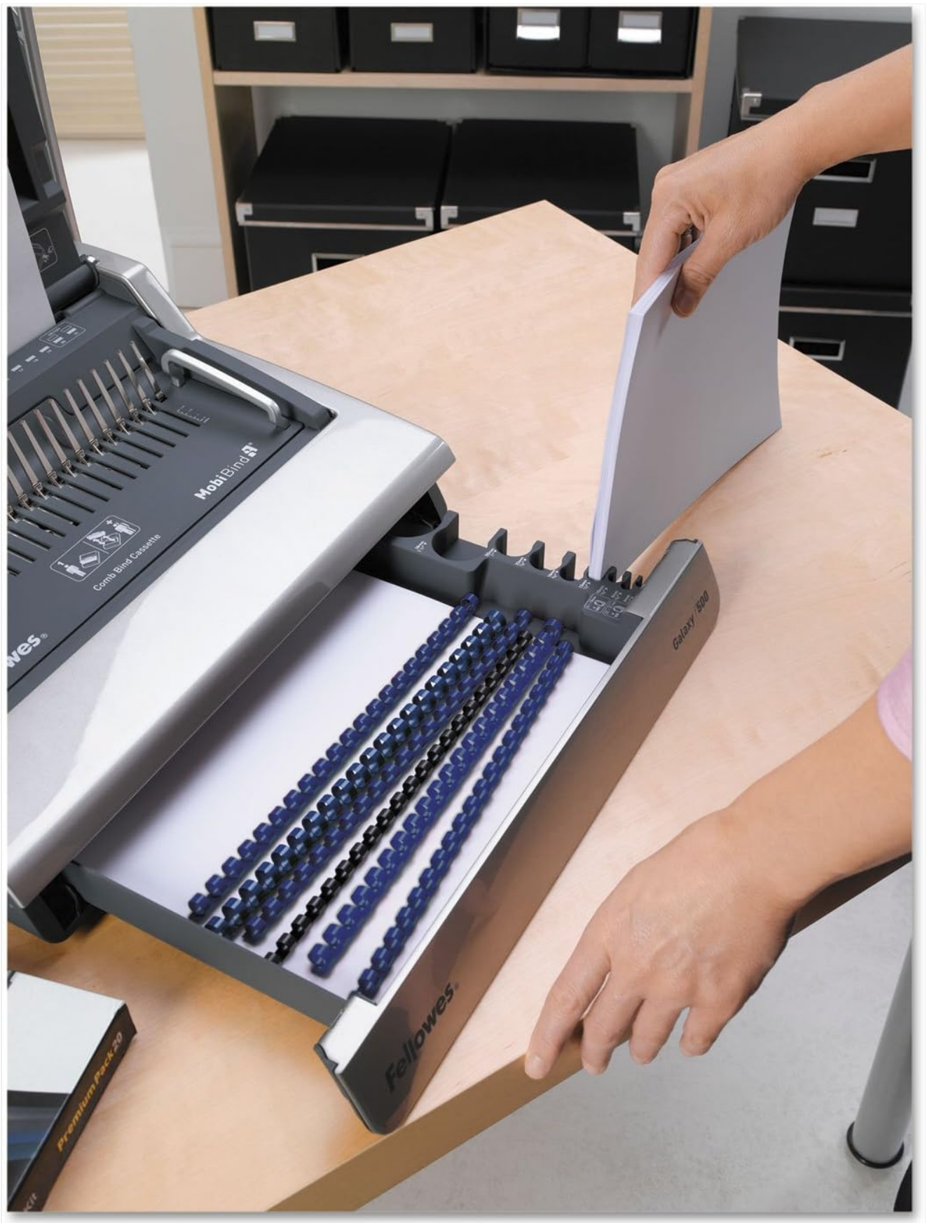
Figure 6: The convenient built-in comb storage tray.