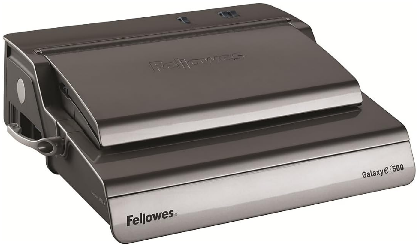
Figure 1: The Fellowes Galaxy E Electric Comb Binding Machine in its closed, compact state.