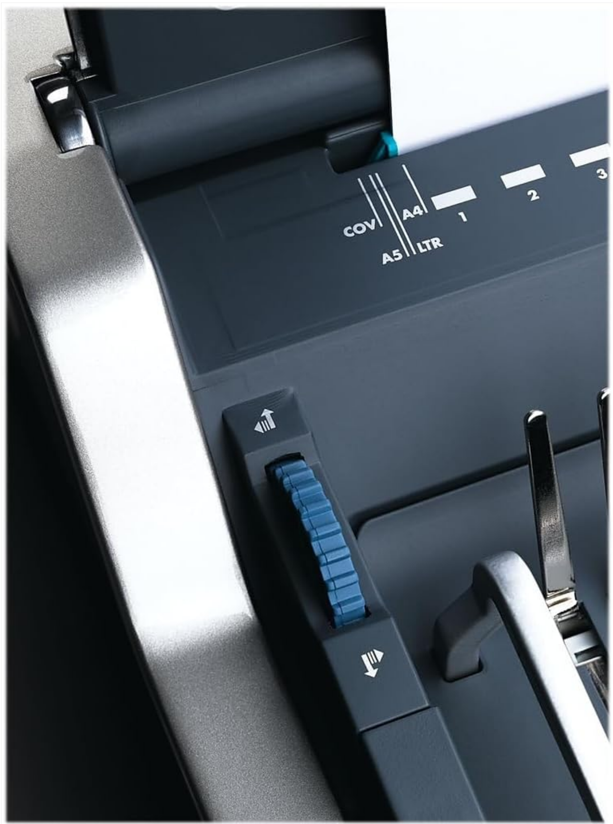
Figure 2: Adjusting the edge guide for accurate document alignment.