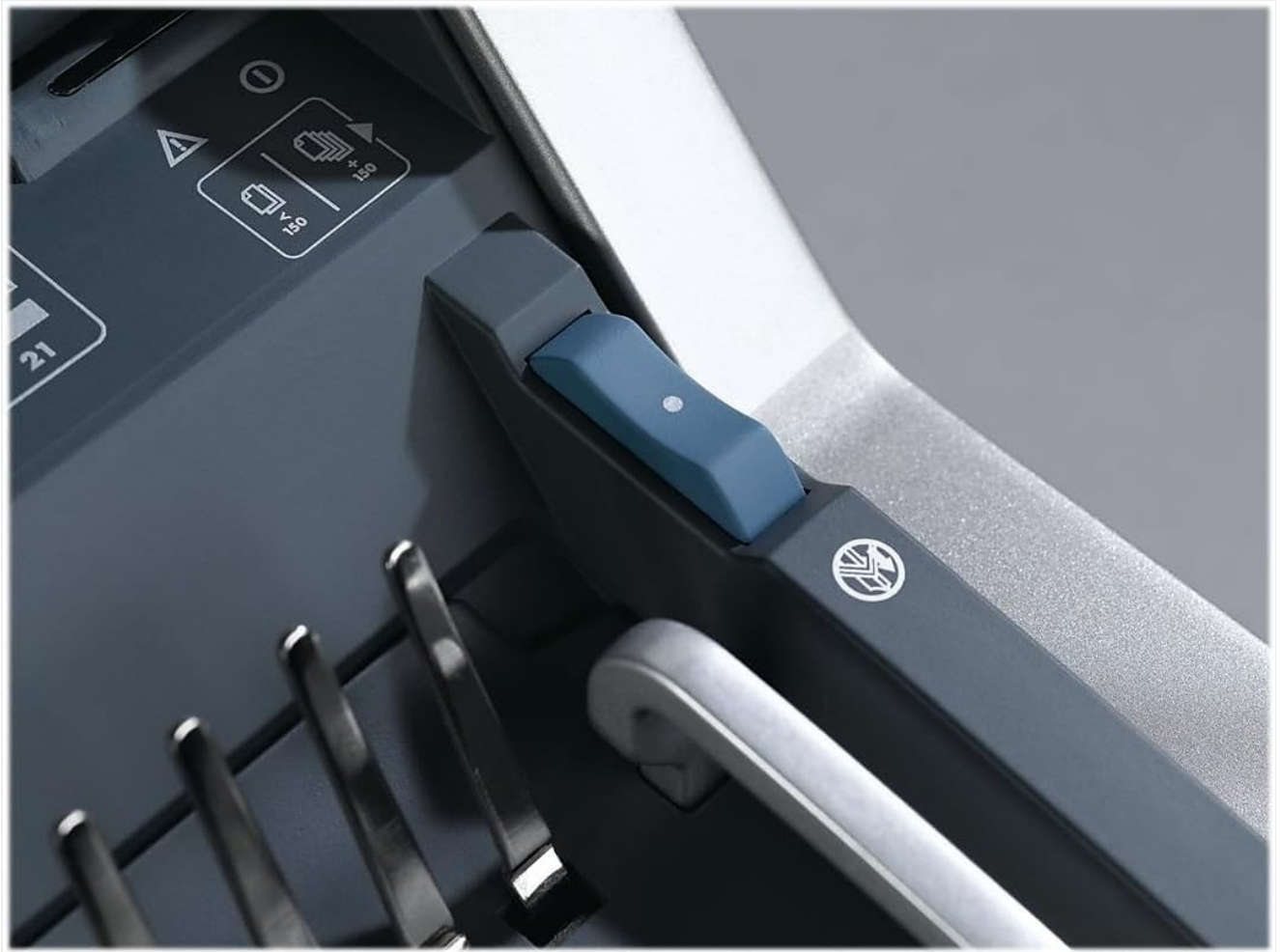
Figure 4: The electric punch button for effortless operation.