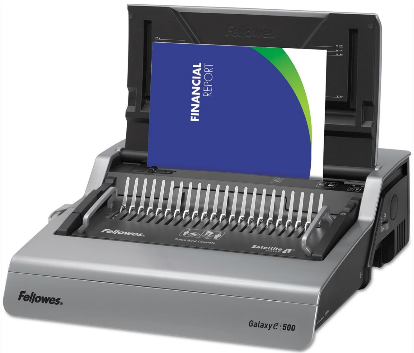
Figure 3: Document loaded vertically into the punching slot.