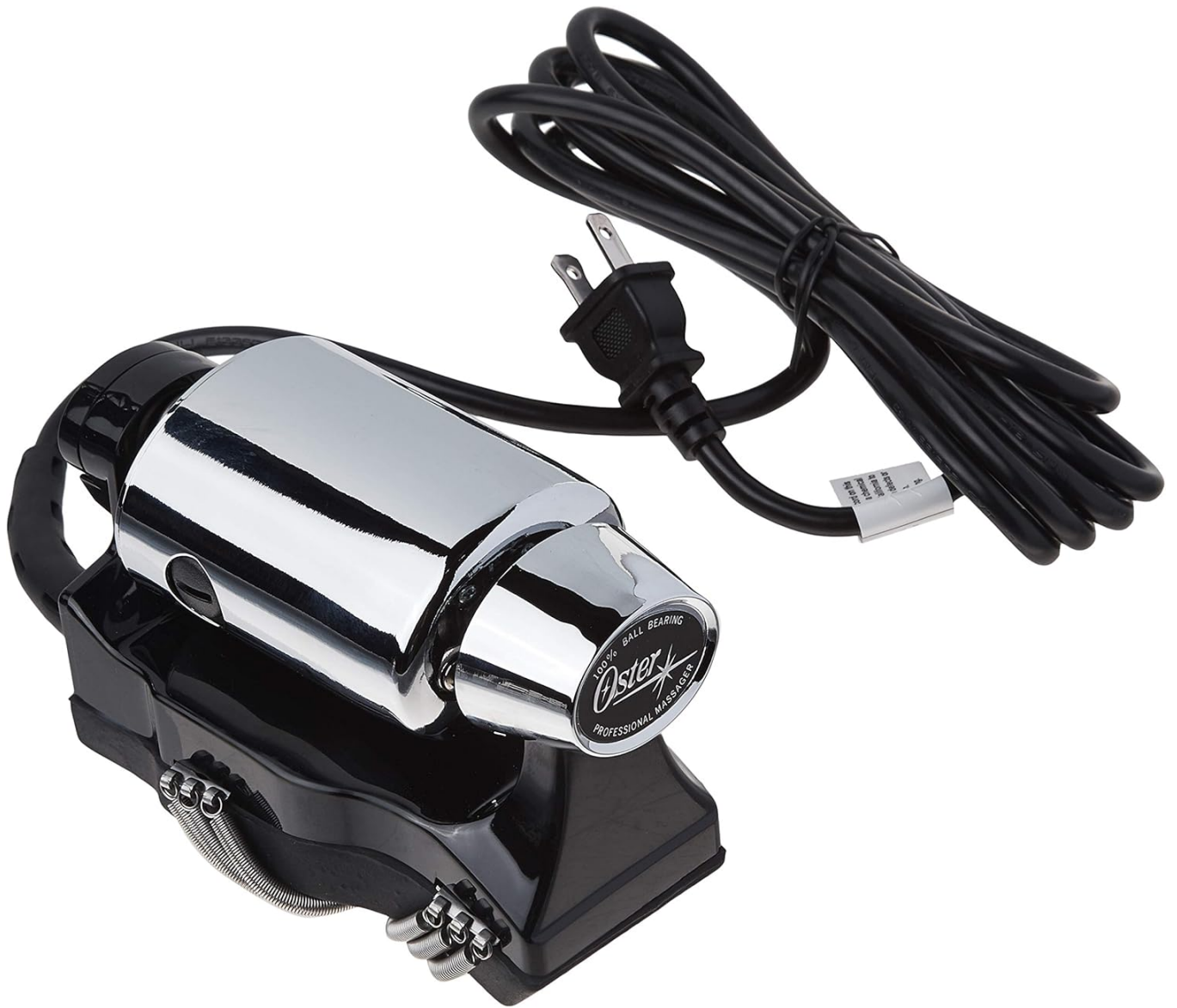
Figure 1: Top-down view of the Oster Professional 103 Stim-U-Lax Massager, showing its chrome housing, black base, and coiled power cord.