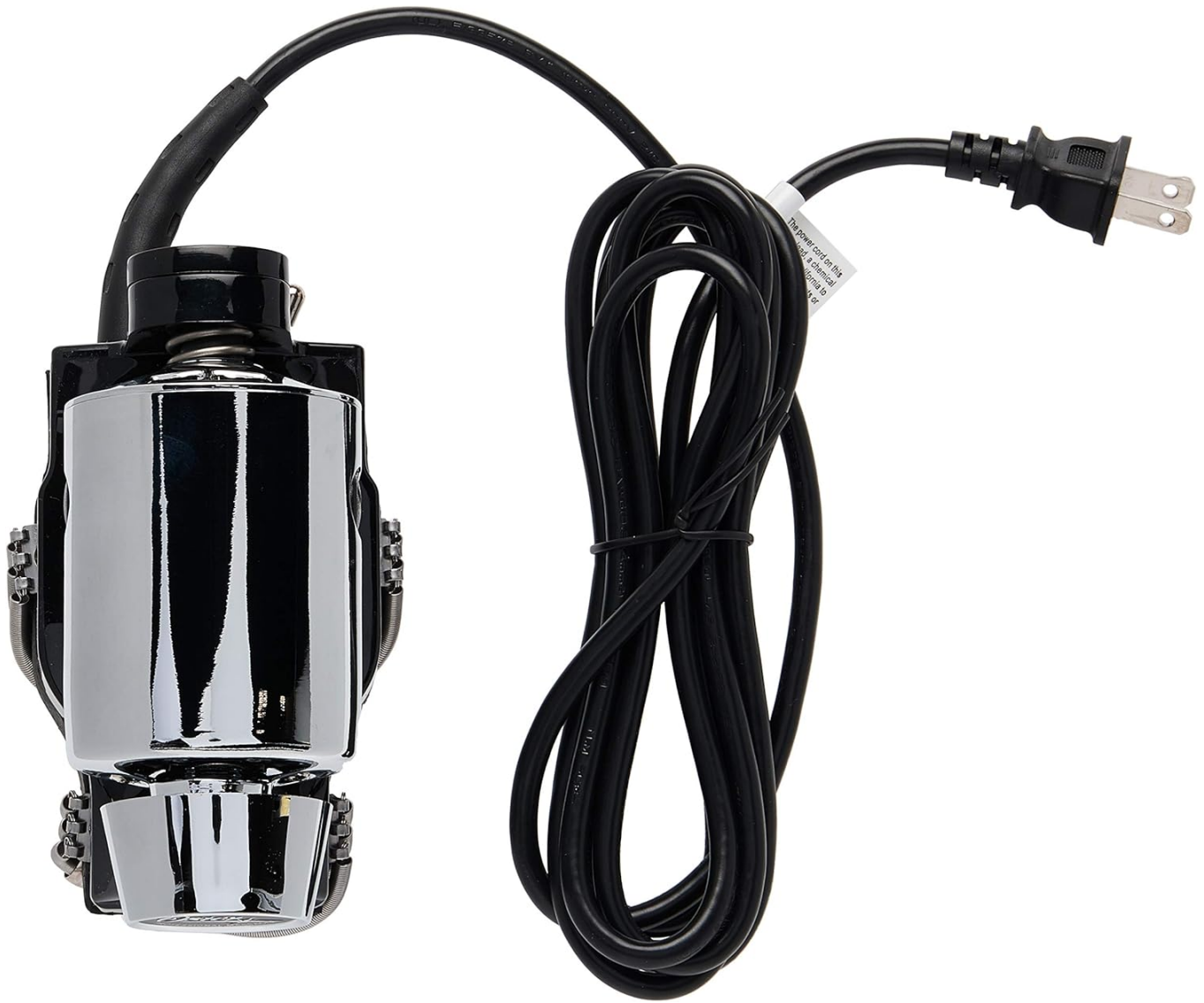
Figure 3: Front view of the massager, showing the chrome body and the full length of the power cord with its plug.