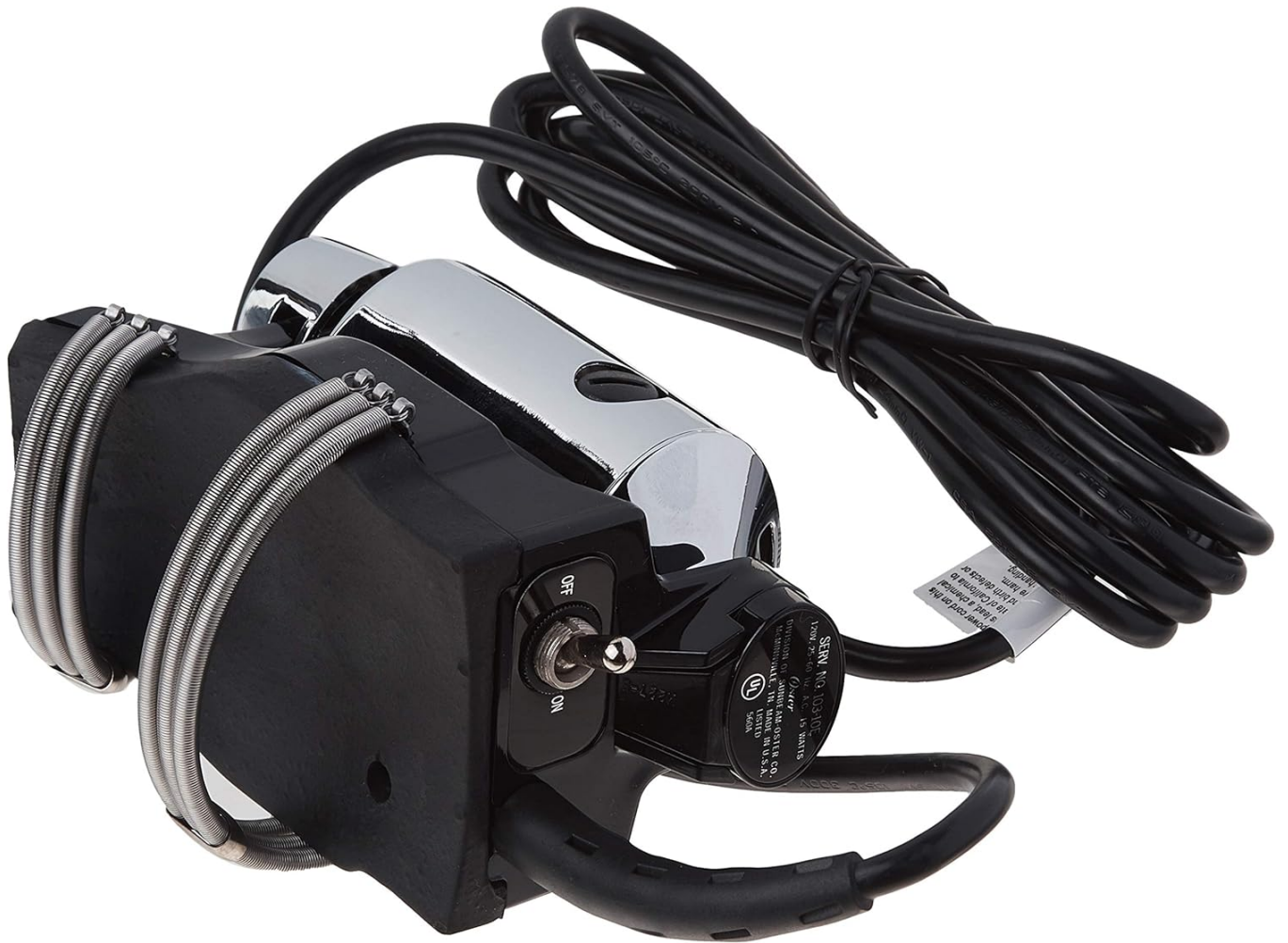
Figure 2: Side view of the massager, highlighting the metal hand straps, the on/off toggle switch, and the power cord connection point.