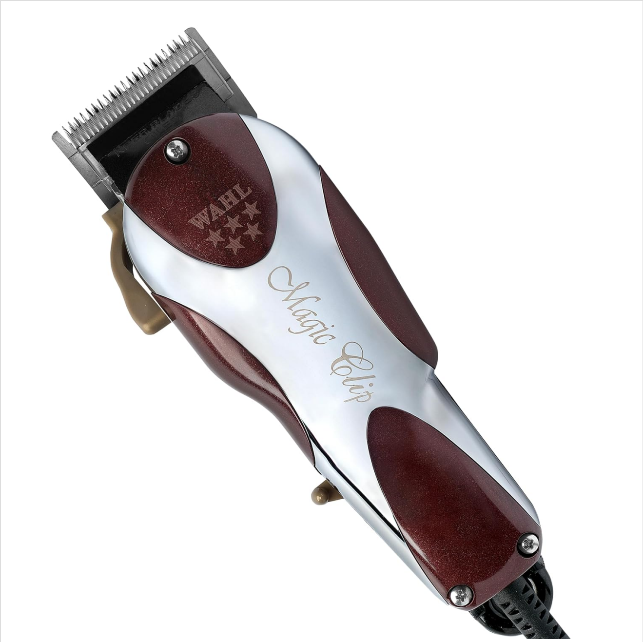
Image: The Wahl Professional 5 Star Magic Clip Precision Fade Clipper.

combined with a variable thumb taper lever, allows for easy adjustment and seamless blending, making it ideal for fading and on-scalp tapering.