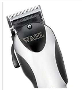
Image: Features of the Wahl Magic Clip, including ergonomic design and powerful motor.