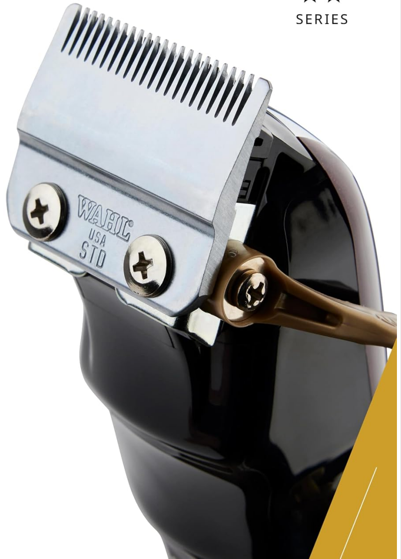
Image: Close-up view of the Magic Clip's stagger-tooth blade, designed for blending.

Equipped with a taper lever for easy fading, blending and tapering. Delivers sharp performance, superior speed and ease of use.