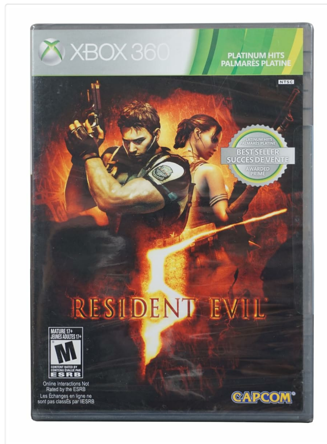
Image: Front cover of the Resident Evil 5 game for Xbox 360, featuring Chris Redfield and Sheva Alomar.