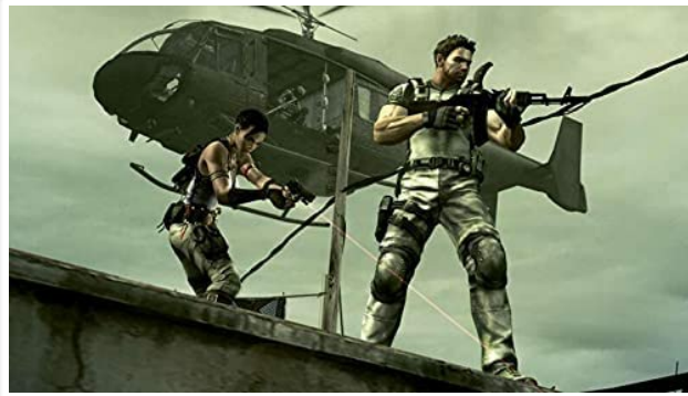
Image: Chris Redfield and Sheva Alomar on a rooftop with a helicopter, illustrating the cooperative aspect and diverse settings.