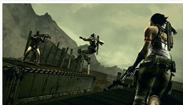
Image: Sheva Alomar navigating an environment by jumping over an obstacle, demonstrating character agility.