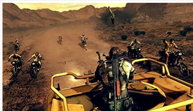
Image: A character on a vehicle being pursued by enemies on motorcycles, highlighting dynamic combat scenarios.