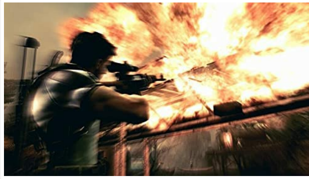
Image: Chris Redfield engaging enemies with a rifle amidst an explosion, showcasing the game's action sequences.