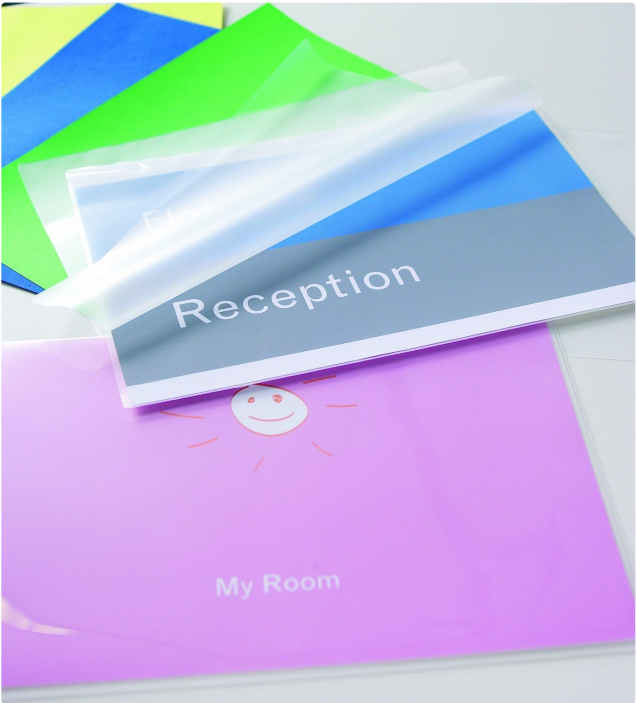
Image 3.1: Preparing a document for self-adhesive lamination and peeling the backing.