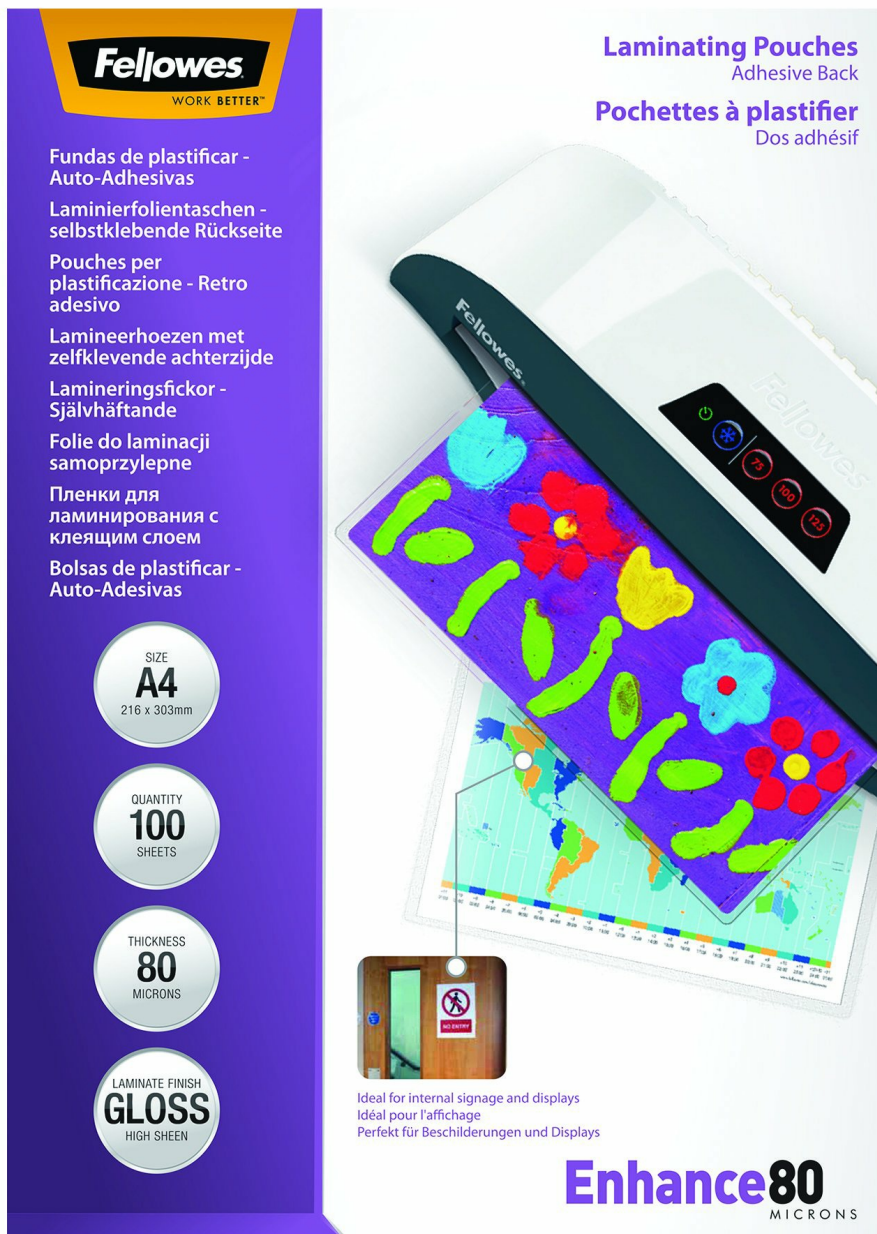
Image 1.1: Example of documents laminated with Fellowes A4 Self-Adhesive Pouches.