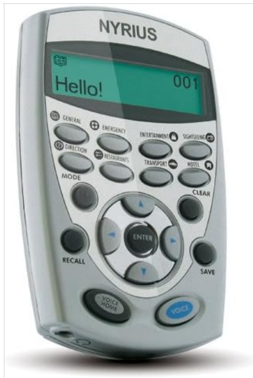
Figure 3.1: Front View of Nyrius LT12 Translator. This image shows the device with its LCD screen displaying "Hello!" and the various function buttons, including category buttons (General, Emergency, Entertainment, Sightseeing, Direction, Restaurants, Transport, Hotel), navigation buttons, and Voice/Voice Home buttons.