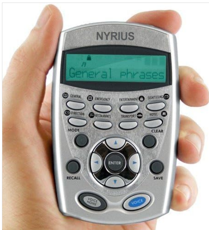
Figure 3.2: Nyrius LT12 Translator in Hand. This image illustrates the compact size of the device, held comfortably in an adult's hand. The screen displays "General phrases," indicating a category selection. The layout of the buttons is clearly visible.